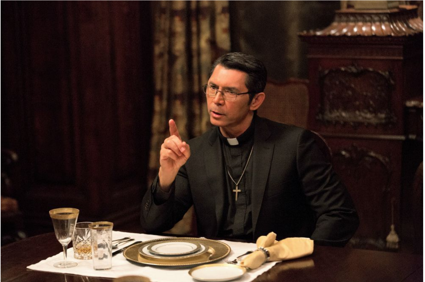
Lou Diamond Phillips

Although the film's production occurred before the start of the #MeToo and #TimesUp movement, the cast is happy to contribute to the larger discussion.