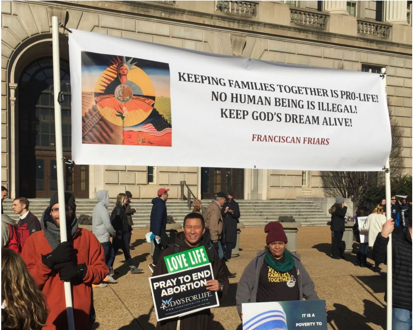
Franciscan friars hold banners at the March for Life Jan. 19 to draw attention to immigration issues.