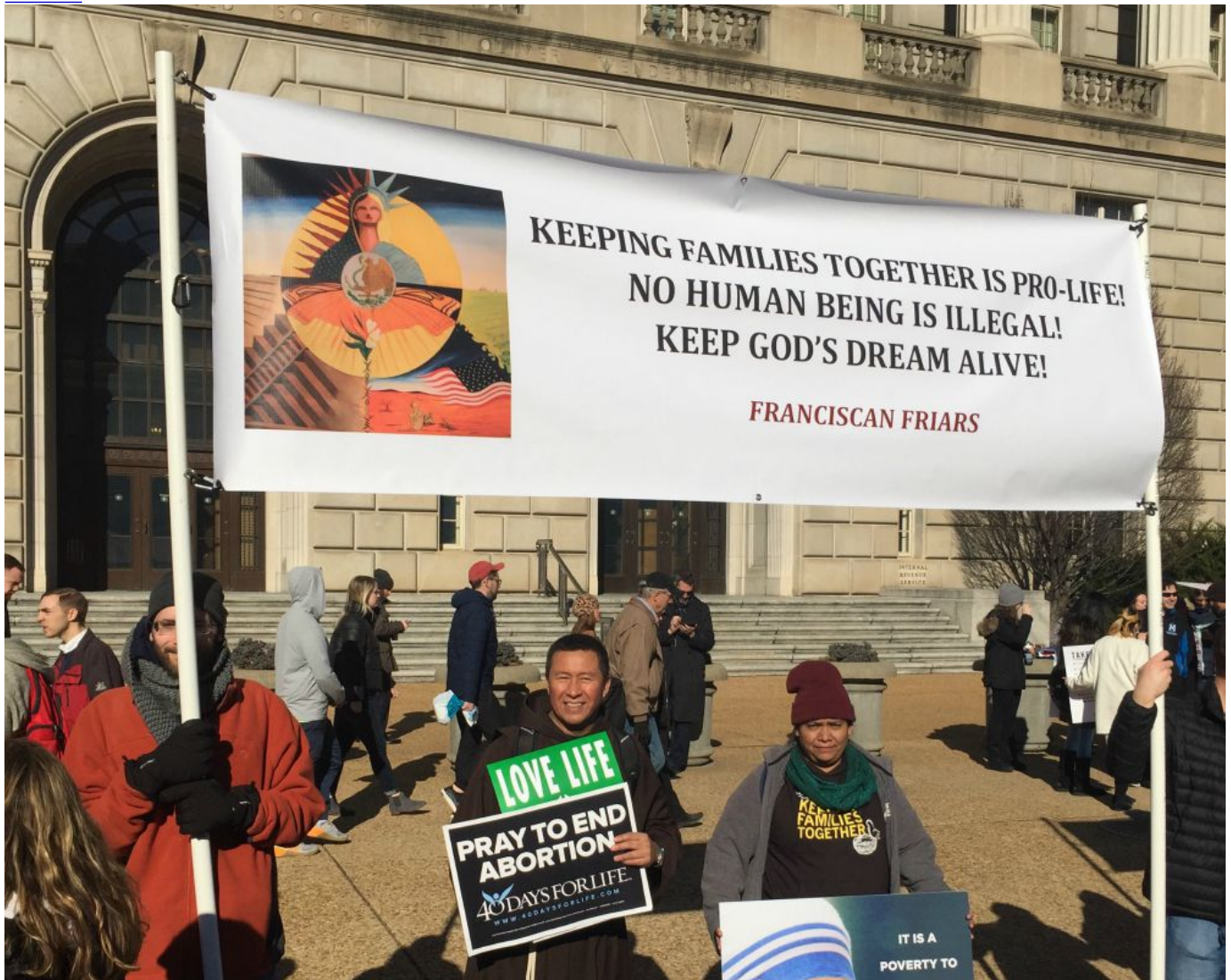
Franciscan friars hold banners at the March for Life Jan. 19 to draw attention to immigration issues.