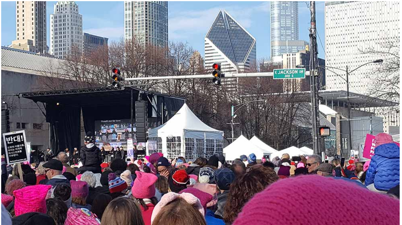
Crowd at the Women's March in Chicago Jan. 20