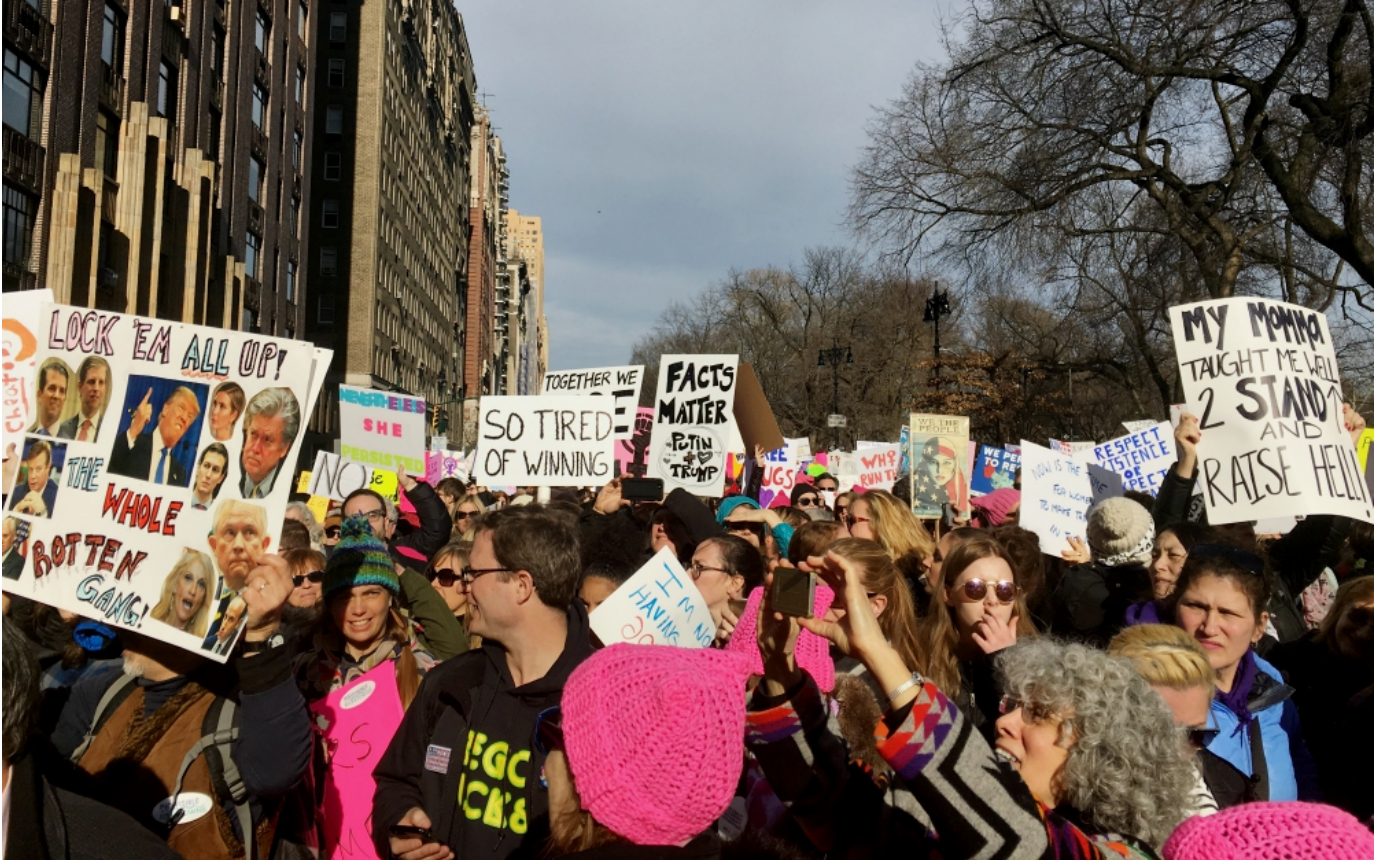
Signs display spirited messages at the 2018 Women's March in New York City