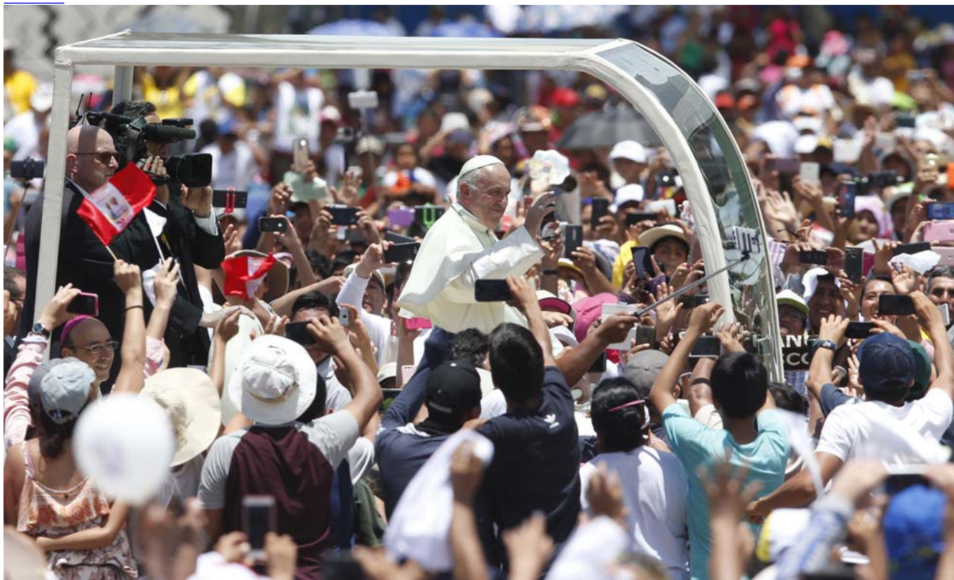
Pope Francis arrives for a meeting with people at the Jorge Basadre Institute in Puerto Maldonado, Peru, Jan. 19.