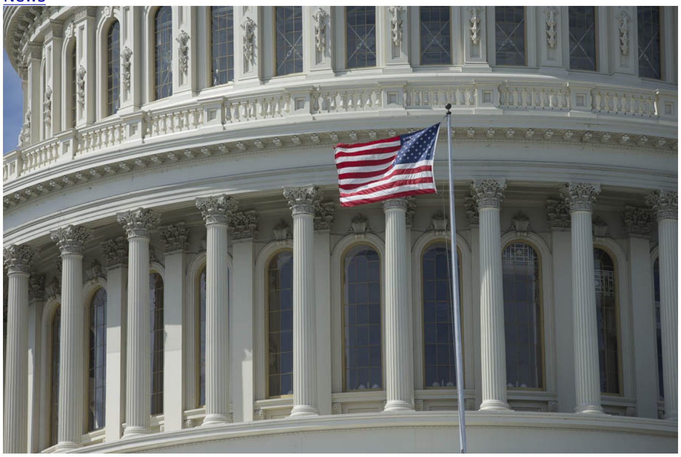
The U.S. Capitol is seen in Washington Sept. 26, 2017.