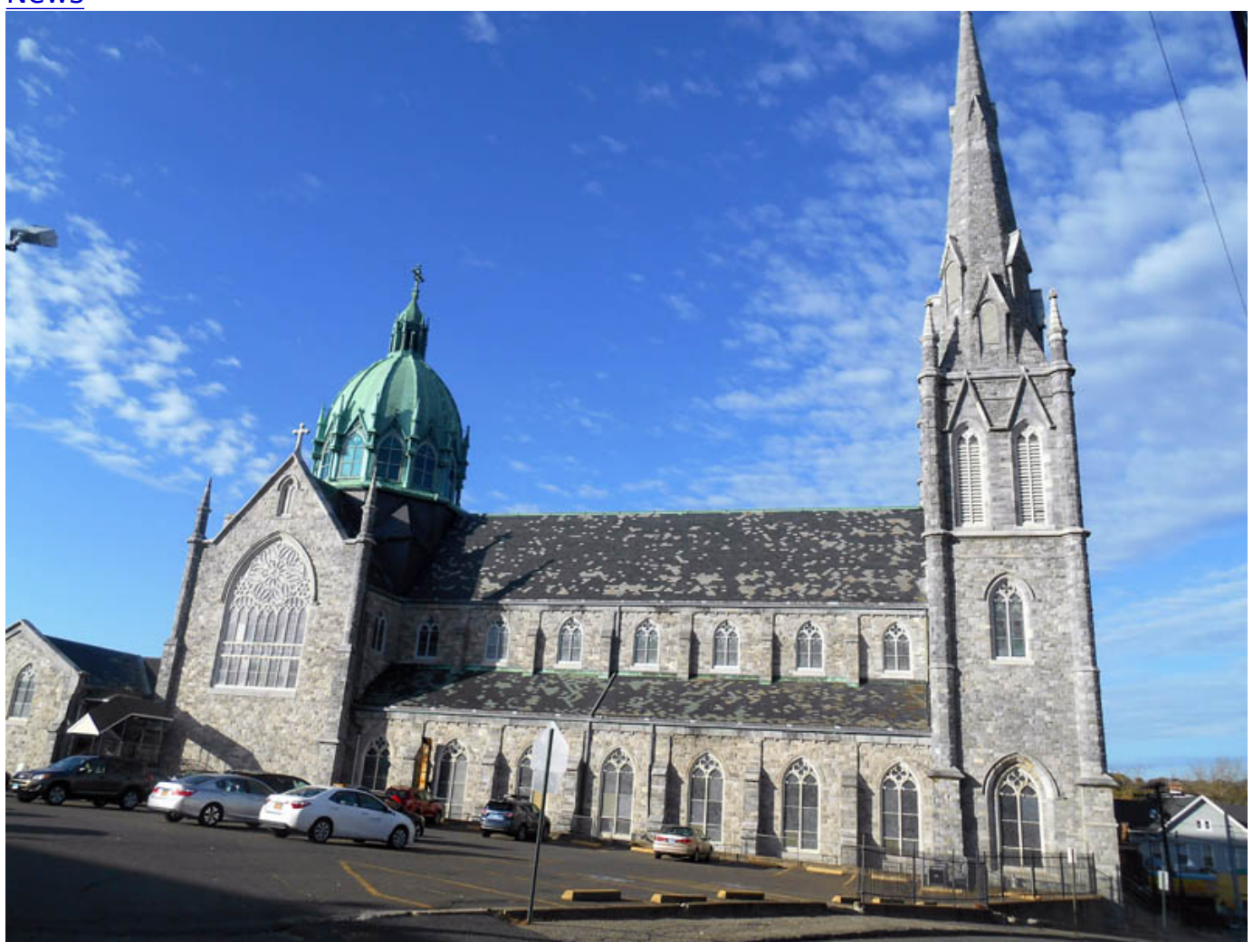
Exterior of St. Anne's Church, now part of All Saints Parish, in Waterbury, Connecticut