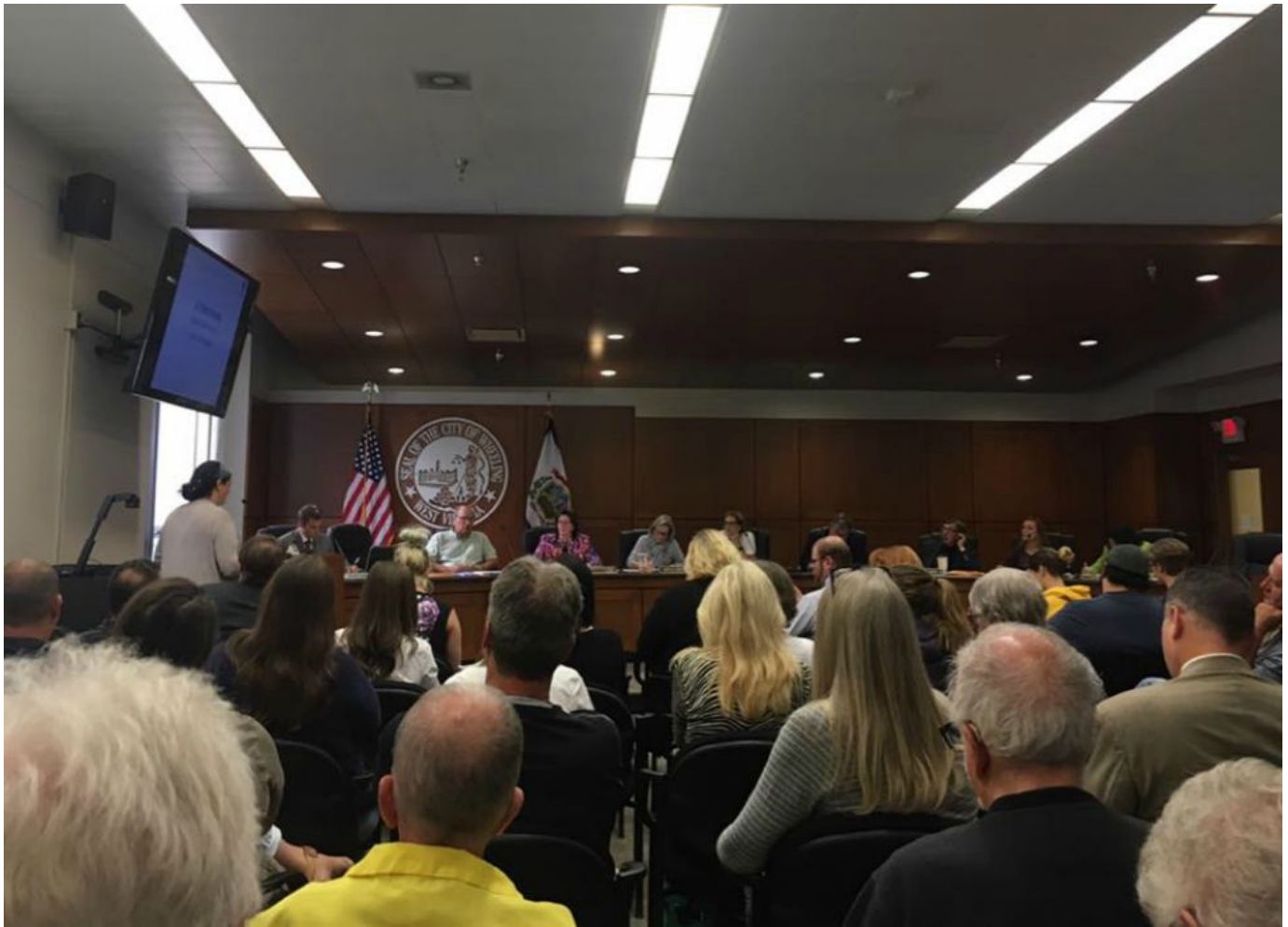
Wheeling, West Virginia Planning Commission meeting Sept. 11, 2017