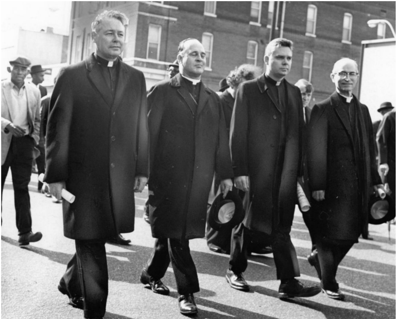
Cardinal Bernard Law, second from right, is pictured during a 1969 march to the Lorraine Hotel in Memphis, Tennessee, for a memorial service for the Rev. Martin Luther King Jr.

Ordained in 1961 for the Diocese of Natchez-Jackson, in Mississippi, Law became a champion for the rural poor and the civil rights movement and received death threats for that work. He was a pioneer in ecumenical relations, which took him in 1968 to his first national office in the U.S. bishops' conference.