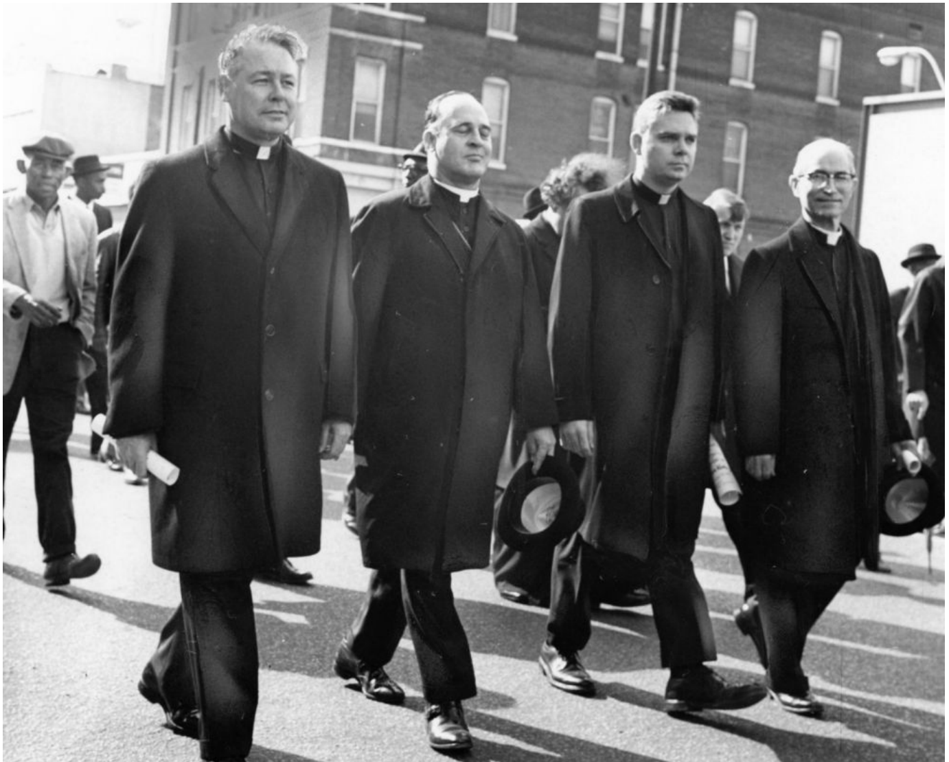
Cardinal Bernard Law, second from right, is pictured during a 1969 march to the Lorraine Hotel in Memphis, Tennessee, for a memorial service for the Rev. Martin Luther King Jr.

Ordained in 1961 for the Diocese of Natchez-Jackson, in Mississippi, Law became a champion for the rural poor and the civil rights movement and received death threats for that work. He was a pioneer in ecumenical relations, which took him in 1968 to his first national office in the U.S. bishops' conference.