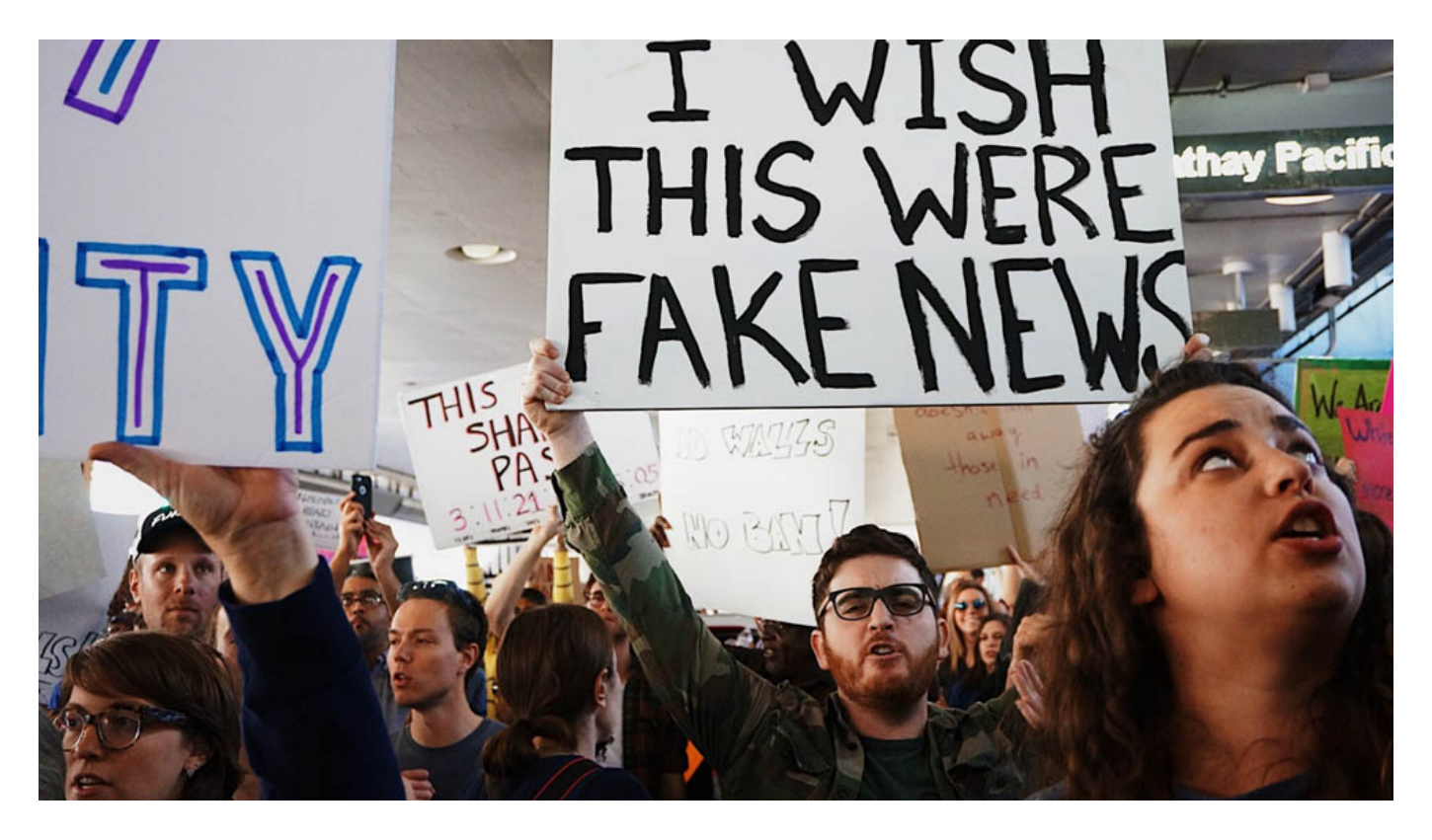
Photo taken at a protest against President Donald Trump's travel ban, at Los Angeles International Airport

even to promote readers or increase clicks. It's very challenging in our society to be truthful and trust that others are truthful."