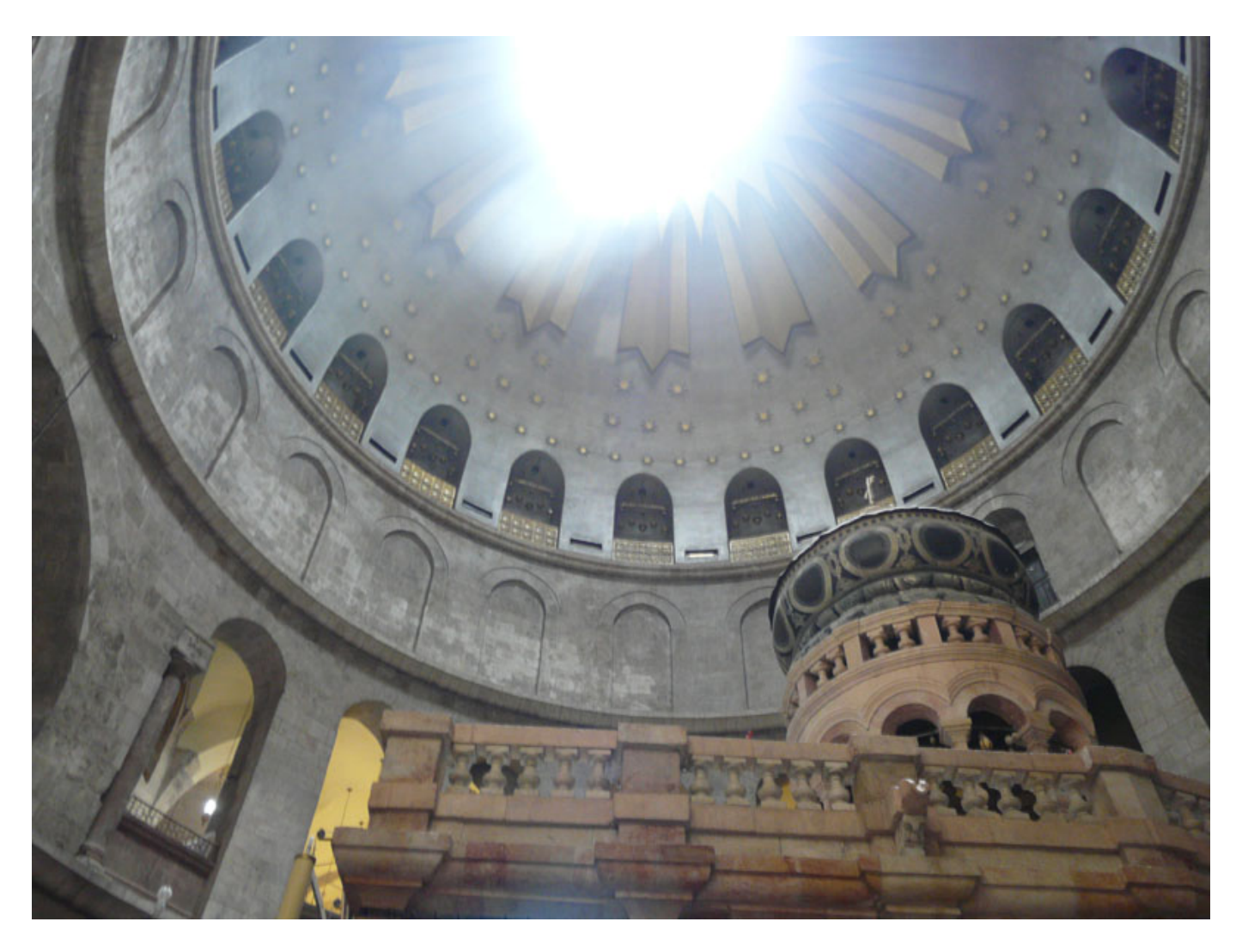
The courtyard of the Church of the Holy Sepulcher

As the work was being done, National Geographic filmed the Edicule and its environs in 3-D. This allows scientists to detect any changes through movements of the earth and address them to avert a crisis. This also allowed the NatGeo team to create a virtual reality tour of the Church of the Holy Sepulcher, an exhibition that is already open at the National Geographic Museum in Washington, D.C., and runs until August 2018.