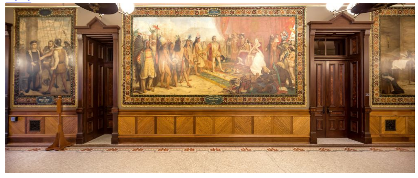
Image some of the 12 murals painted by Luigi Gregori between 1882-84 in the Main Building of Notre Dame University.