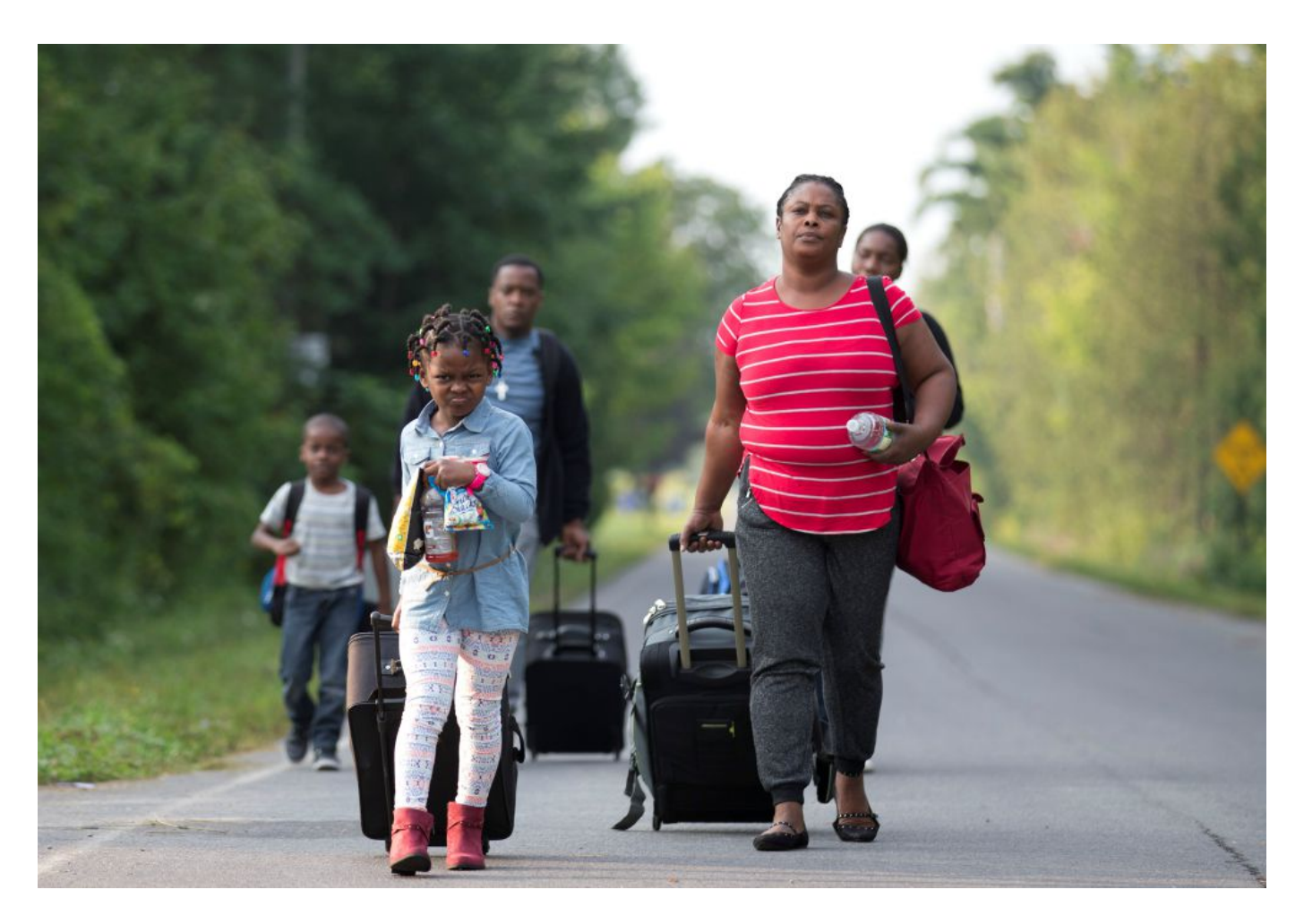
A Haitian family walks to cross the U.S.-Canada border into Quebec from New York Aug. 29.

Briefings from CLINIC on both countries, and an Oct. 31 <u>letter</u> from a coalition of Catholic groups including Catholic Relief Services and the U.S. bishops' Committee on Migration, support the claim that violence, food insecurity and economic conditions make <u>Honduras</u> and <u>El Salvador</u> too dangerous for Temporary Protected Status holders to return.