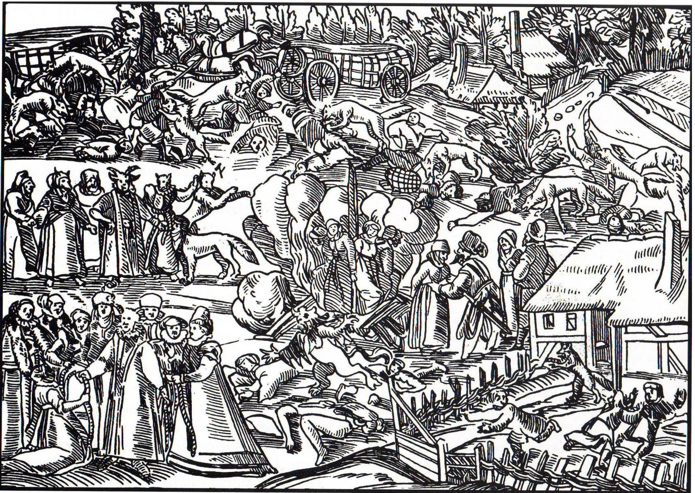
By Anonymous at Bayerisches National Museum in Munich. (Public domain, via Wikimedia Commons)

But there were others who would say that a love potion is a good thing because marriage can be difficult sometimes. The embers cool a little bit, and it would be good for the embers to be relit. So, they would go back and forth on that.