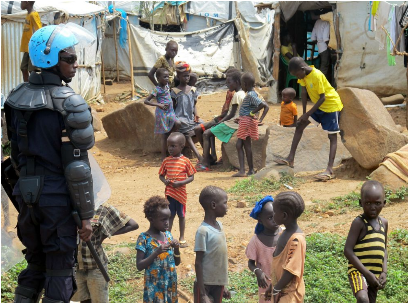
A U.N. peacekeeper keeps watch as children gather in a camp for displaced civilians in Juba, South Sudan in June. The heads of the member churches of the South Sudan Council of Churches criticized the country's political leaders "on all sides" for placing political and personal interests above the needs of ordinary people.