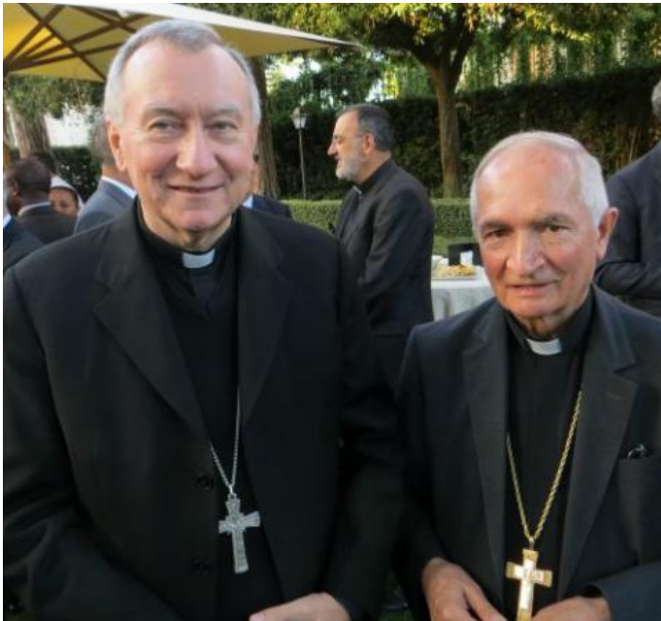
Cardinal Pietro Parolin, left, with Archbishop Silvano Tomasi at a U.S. embassy to the Holy See event Sept. 22

"We are aware of the invaluable experiences he has gained over the years," she said. "We are aware of his ability to master the art of diplomacy and his deep sense for politics."