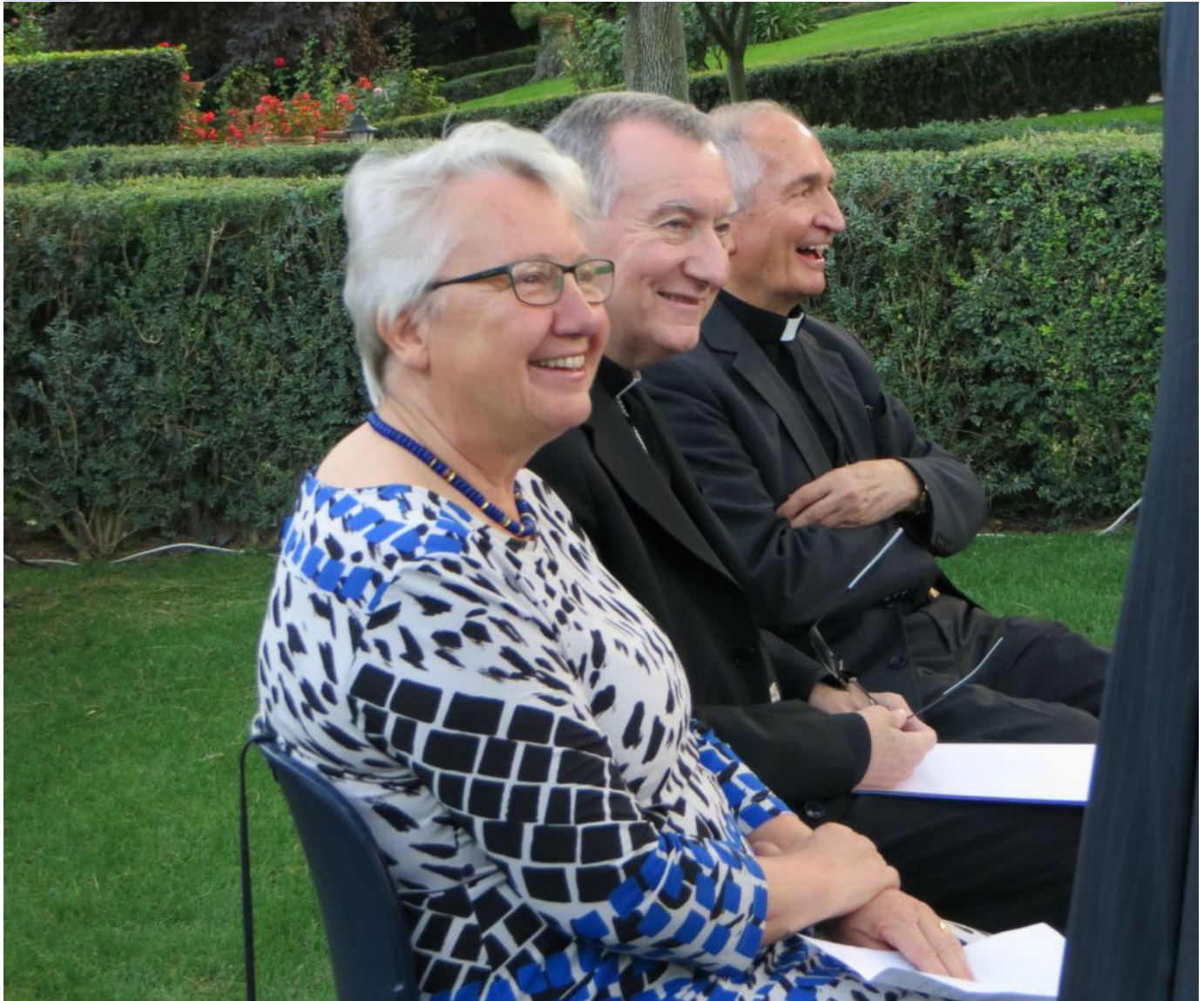
German ambassador to the Holy See Annette Schavan, Cardinal Pietro Parolin and Archbishop Silvano Tomasi are pictured at a U.S. embassy to the Holy See event Sept. 22.