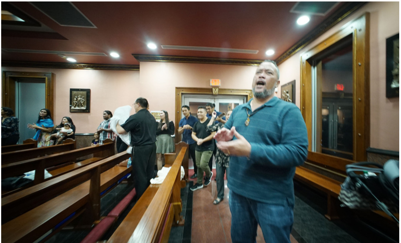
Celebrants sing, dance and play music joyfully during a lively Neocatechumenal Way service in Hagatña.

The orchestrated nature of the allegations against Apuron helps fuel the doubt, especially among followers of the Neocatechumenal Way who feel scapegoated.