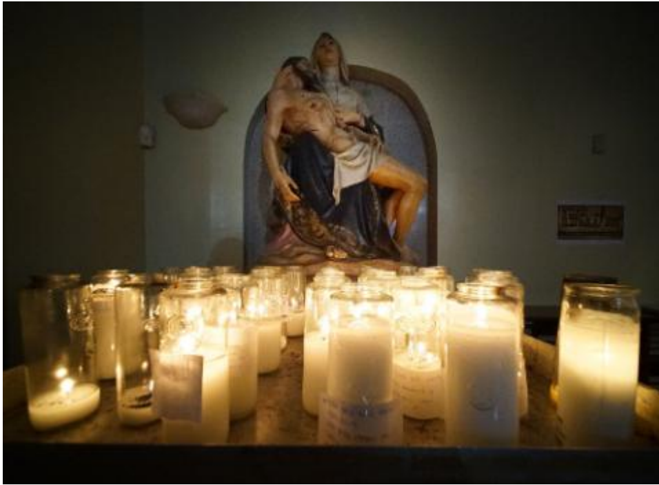
Candles flicker in the Dulce Nombre de Maria Cathedral Basilica in Hagatña, Guam.

For some on Guam, the turmoil calls into question what it means to be Chamorro on an island where religion is for many inseparable from indigenous culture.