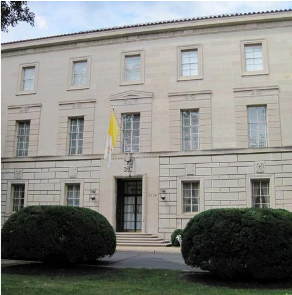
Apostolic nunciature in Washington, D.C.

This is certainly progress from the days when reporters would have only gotten a "no comment" from the Vatican. But, for the most part, the Vatican is making a mess of it. The Vatican followed the old, failed strategy of saying as little as possible rather than getting all of the story out at one time. Today, professional PR firms recommend getting all of the bad news out as soon as possible in order to limit the number of follow-up stories.