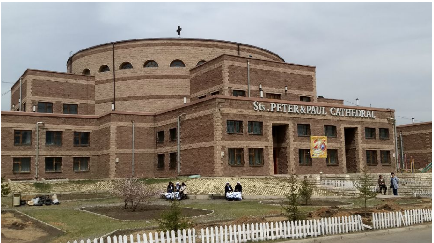
The Cathedral of Sts. Peter and Paul was built in 2003 and is modeled after the traditional nomadic tent used in Mongolia.

As the Federation of Asian Bishops' Conferences have often taught, mission in Asia begins with being with the people, responding to their needs, and witnessing to the values of the reign of God here on Earth. This before-death salvation brought about by the disciples of Christ serves as foretaste and sign of God's kingdom that is to come in heaven. It may be years before a local community emerges and a church established.