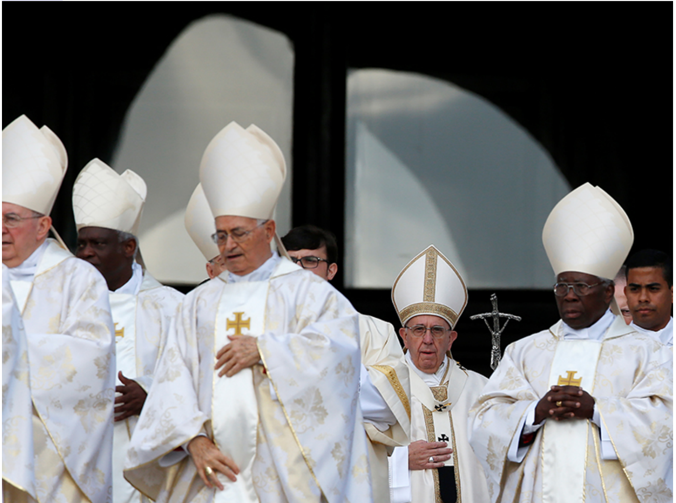
Pope Francis arrives to lead a Mass for the Jubilee for Priests at St. Peter's Square at the Vatican on June 3, 2016.