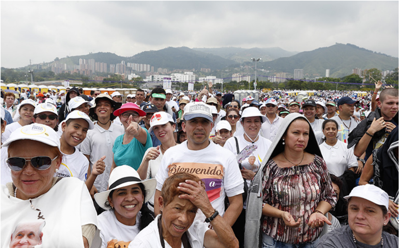
People attend Pope Francis' celebration of Mass at Enrique Olaya Herrera Airport in Medellin, Colombia, Sept. 9.

The Mass celebrated the feast day of St. Peter Claver, a 17th-century Spanish Jesuit missionary in Colombia known for his ministry to African slaves.