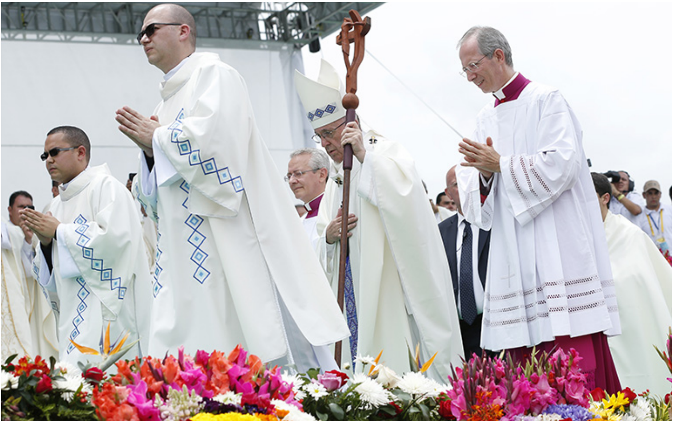
Pope Francis arrives in procession to celebrate Mass at Enrique Olaya Herrera Airport in Medellin, Colombia, Sept. 9.

Medellín, about 260 miles northwest of Bogotá, is the Colombia's second-largest city with a population of some 2.5 million. Once the home of Pablo Escobar and notorious instances of gun and drug violence, the city is now praised for its development policies, educational system and newly constructed commuter rail network.