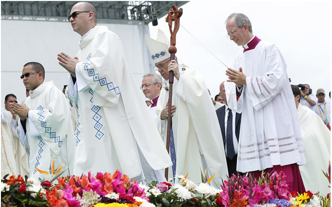
Pope Francis arrives in procession to celebrate Mass at Enrique Olaya Herrera Airport in Medellin, Colombia, Sept. 9.

Medellín, about 260 miles northwest of Bogotá, is the Colombia's second-largest city with a population of some 2.5 million. Once the home of Pablo Escobar and notorious instances of gun and drug violence, the city is now praised for its development policies, educational system and newly constructed commuter rail network.