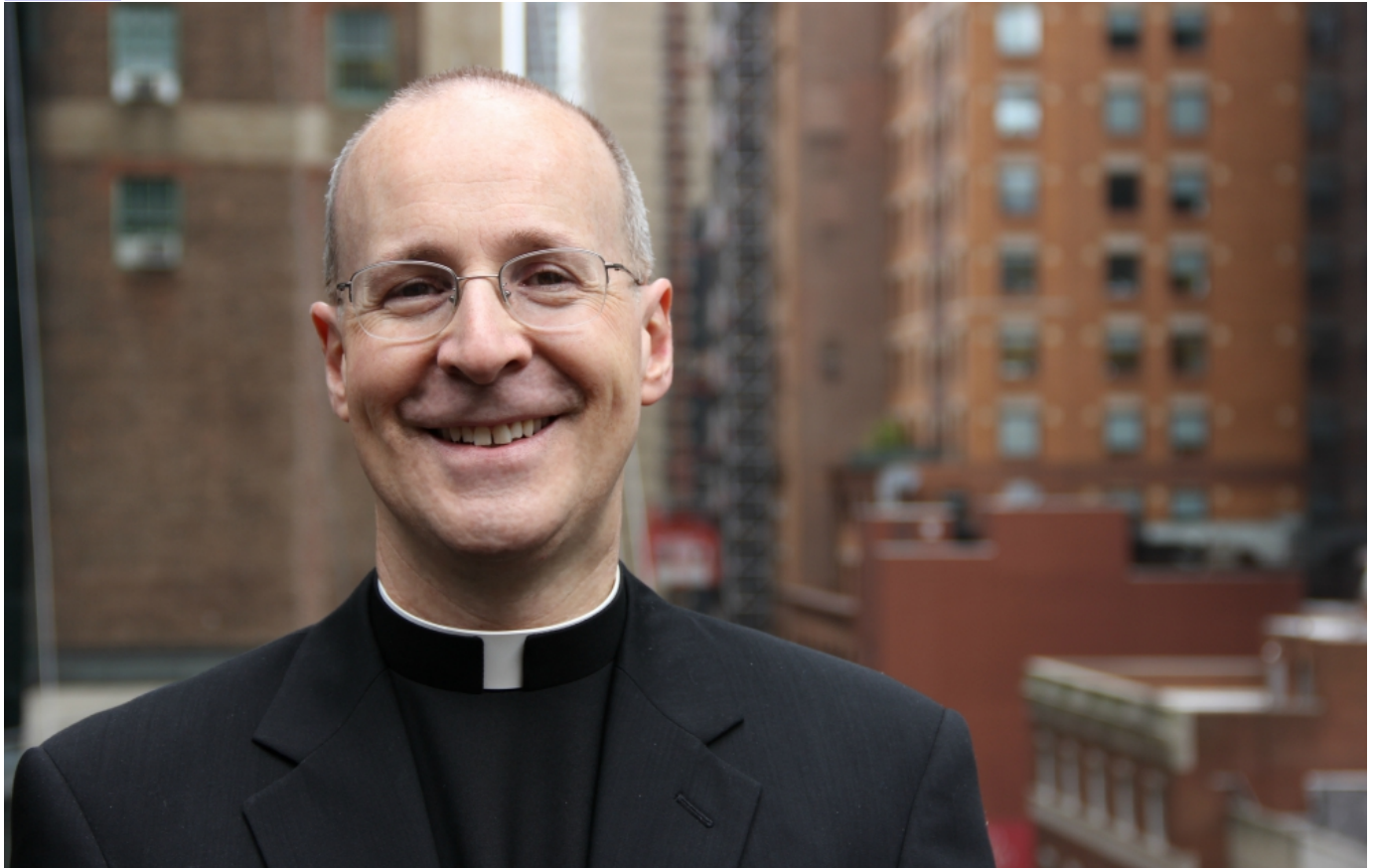
Jesuit Fr. James Martin