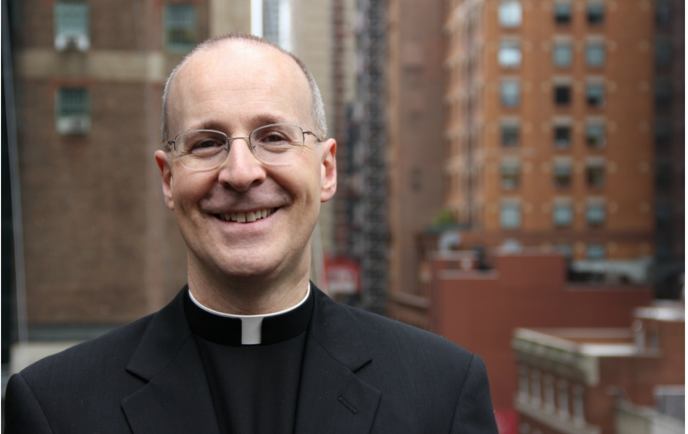
Jesuit Fr. James Martin