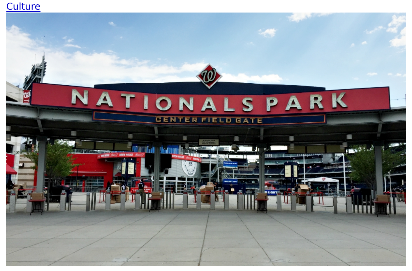
Centerfield Gate at Nationals Park in Washington, D.C.