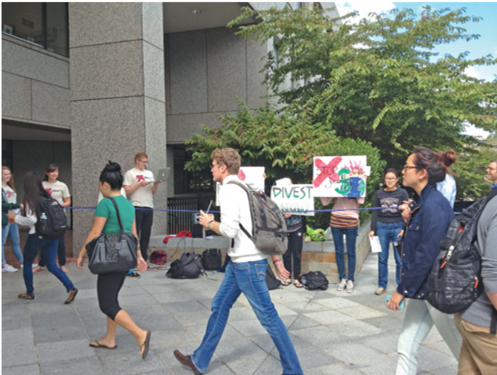
A call to divest from fossil fuels

Citing Jesuit values and Catholic teaching, students join nationwide push