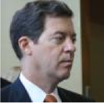
St. Paul, Minn.

One of the most prominent Catholics in the Republican Party says that it is time for his party to stop conceding the social justice message to Democrats. Sen. Sam Brownback, R-Kan., a Catholic convert who ran for his party's nomination for president last year, told NCR that his party is still hesitant to passionately embrace some aspects of Catholic social teaching.