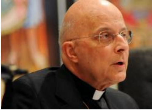
Cardinal Francis George

Chicago's George says both liberals and conservatives focus too much on bishops, not enough on Christ