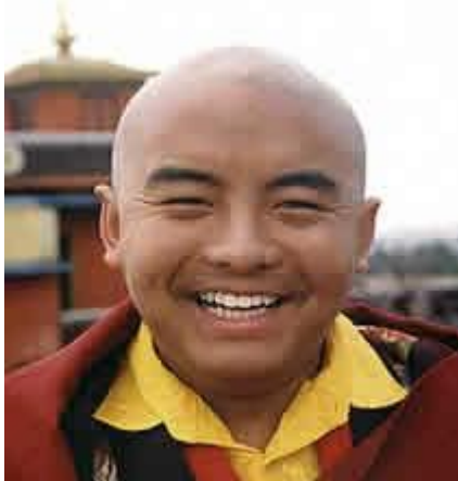
Yongey Mingyur Rinpoche