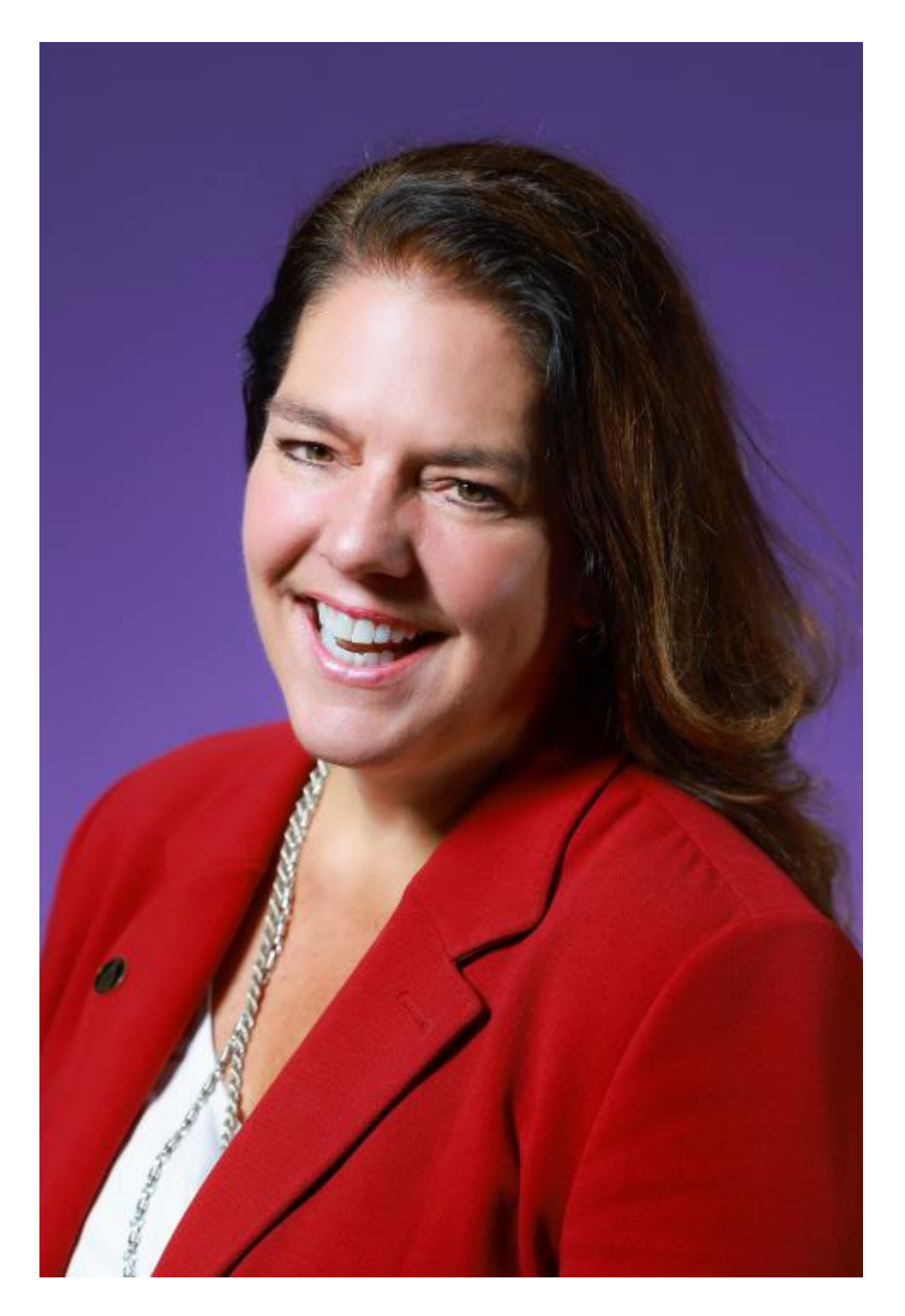
Kerry Alys Robinson, president and CEO of Catholic Charities USA, condemned the demonization of agency employees who work with immigrants.

For Pajanor, whose group operates homeless shelters and 14 food pantries in the city, the recent avalanche of hate followed a visit by James O'Keefe, a far-right