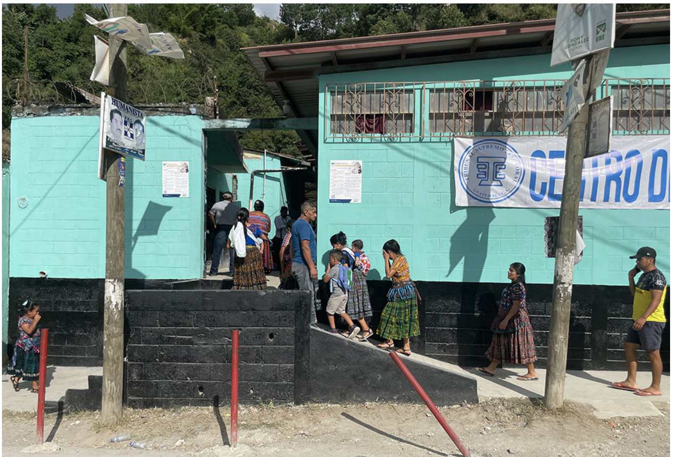
Families enter a voting center in Chinautla, on the edge of Guatemala City, in mid-August.

The United States, supportive of the new president and the initiatives to shore up democracy as well as human rights, seems prepared to finally do something right by Guatemala.