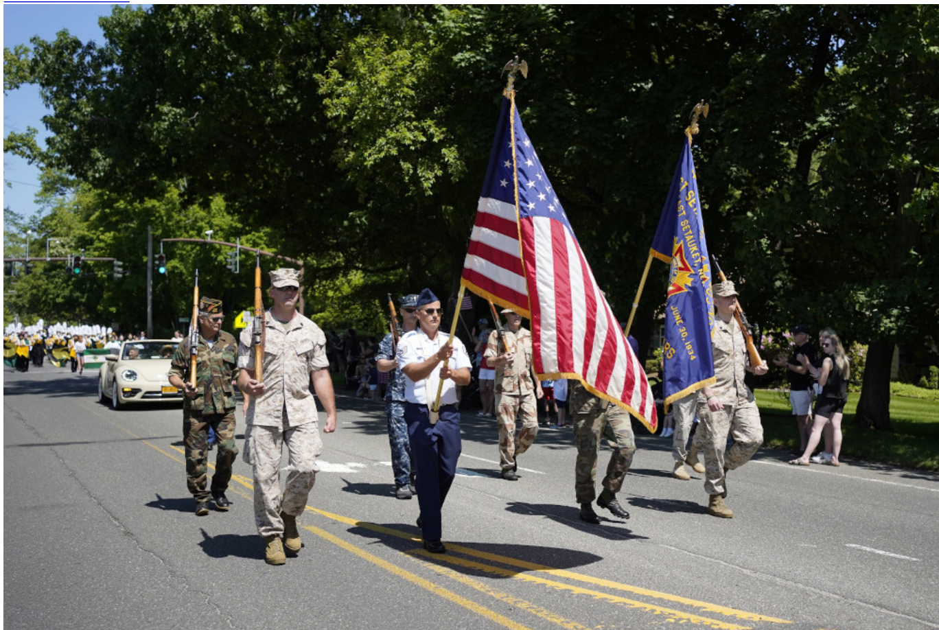
U.S. military veterans march in the annual Memorial Day parade in Setauket, New York, May 30, 2022.