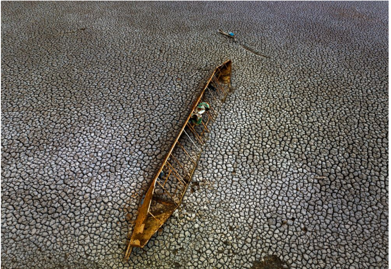
An old boat is photographed half-buried after the water level has dropped at the Sau reservoir, about 100 km (62 miles) north of Barcelona, Spain, Tuesday, April 18, 2023.