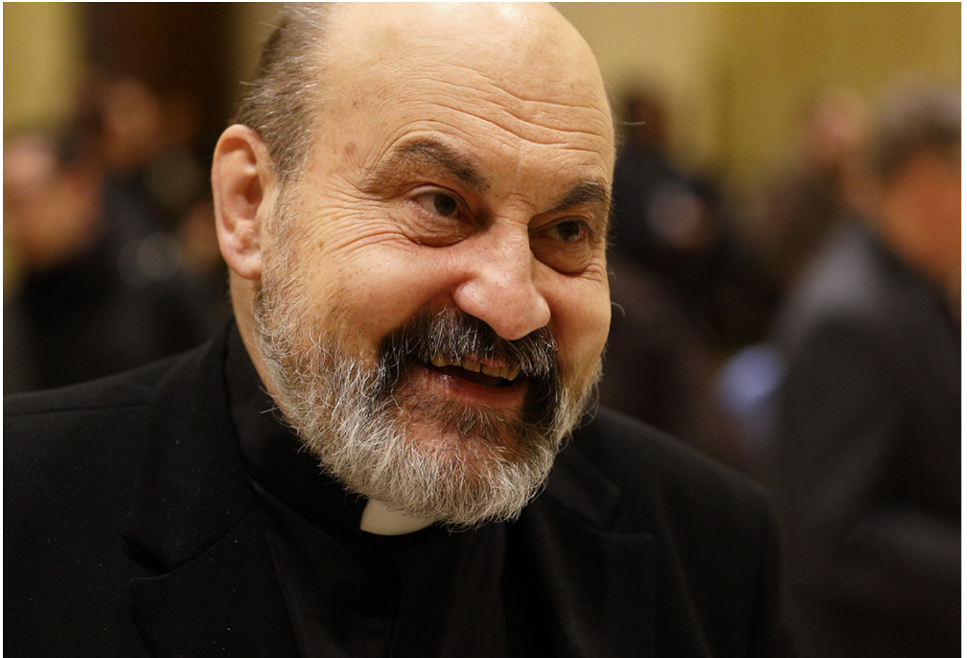
Czech theologian Fr. Tomas Halik is pictured in a 2015 photo.

In his introduction to the assembly, made available online , Czech theologian Fr. Tomas Halik recalled how Pope Benedict XVI, after a visit to the Czech Republic in 2009, first expressed the idea that the church should, like the Temple of Jerusalem, form a "courtyard of the Gentiles."