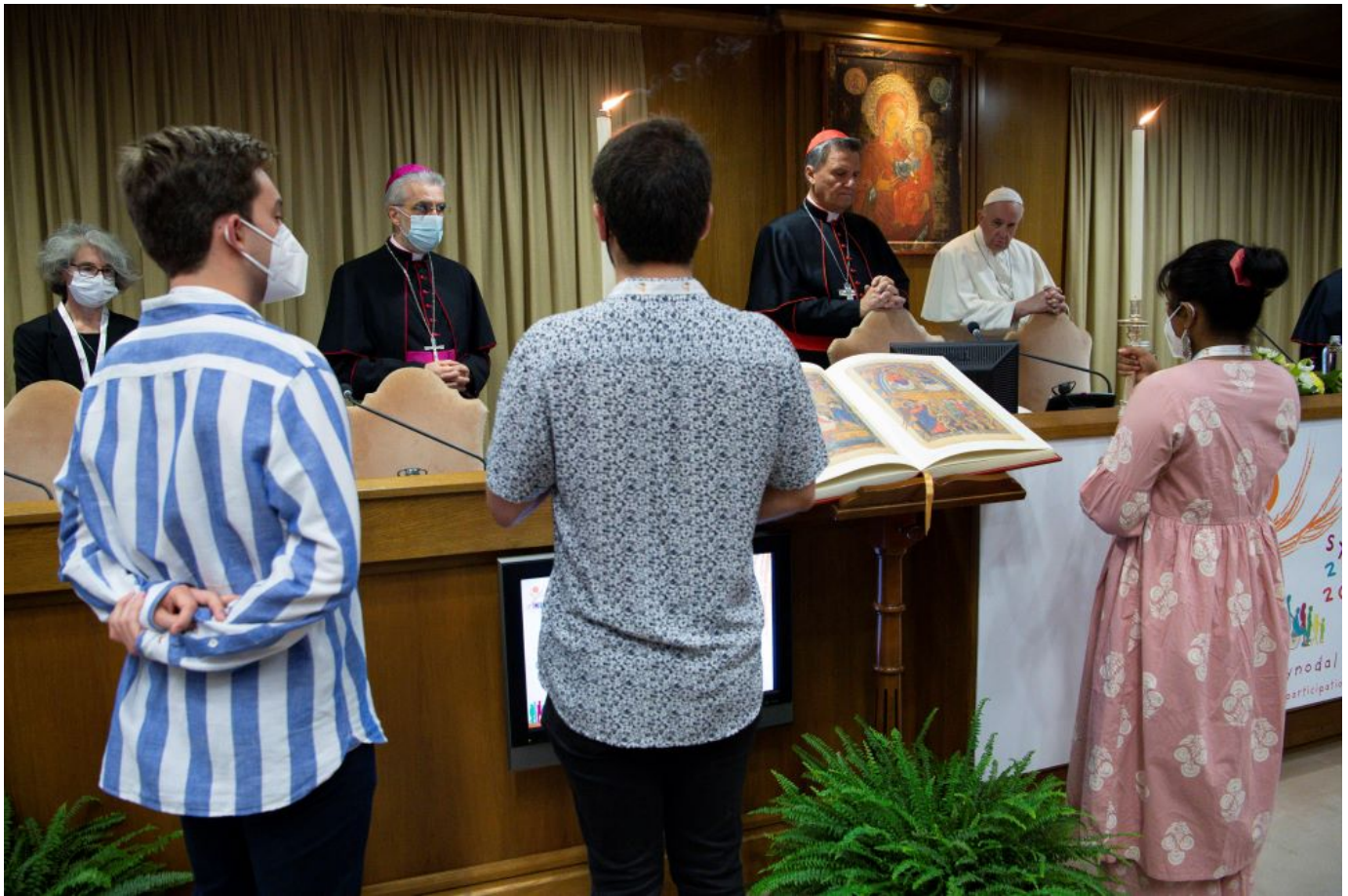
Pope Francis leads a meeting with cardinals, bishops, priests, religious and laypeople from around the world in the Synod Hall at the Vatican Oct. 9, 2021.

Authority in the church, in other words, is spiritual, and bottom-up. It rests on processes that discover the Spirit's will. It is to take seriously what Jesus promises in the Gospel of John: that the Spirit will guide us, strengthen us, teach us, bring us peace, so that we need not be fearful or anxious. We will have no need of authoritarianism, coercion and control, because it is not our power we rely on, but God's.