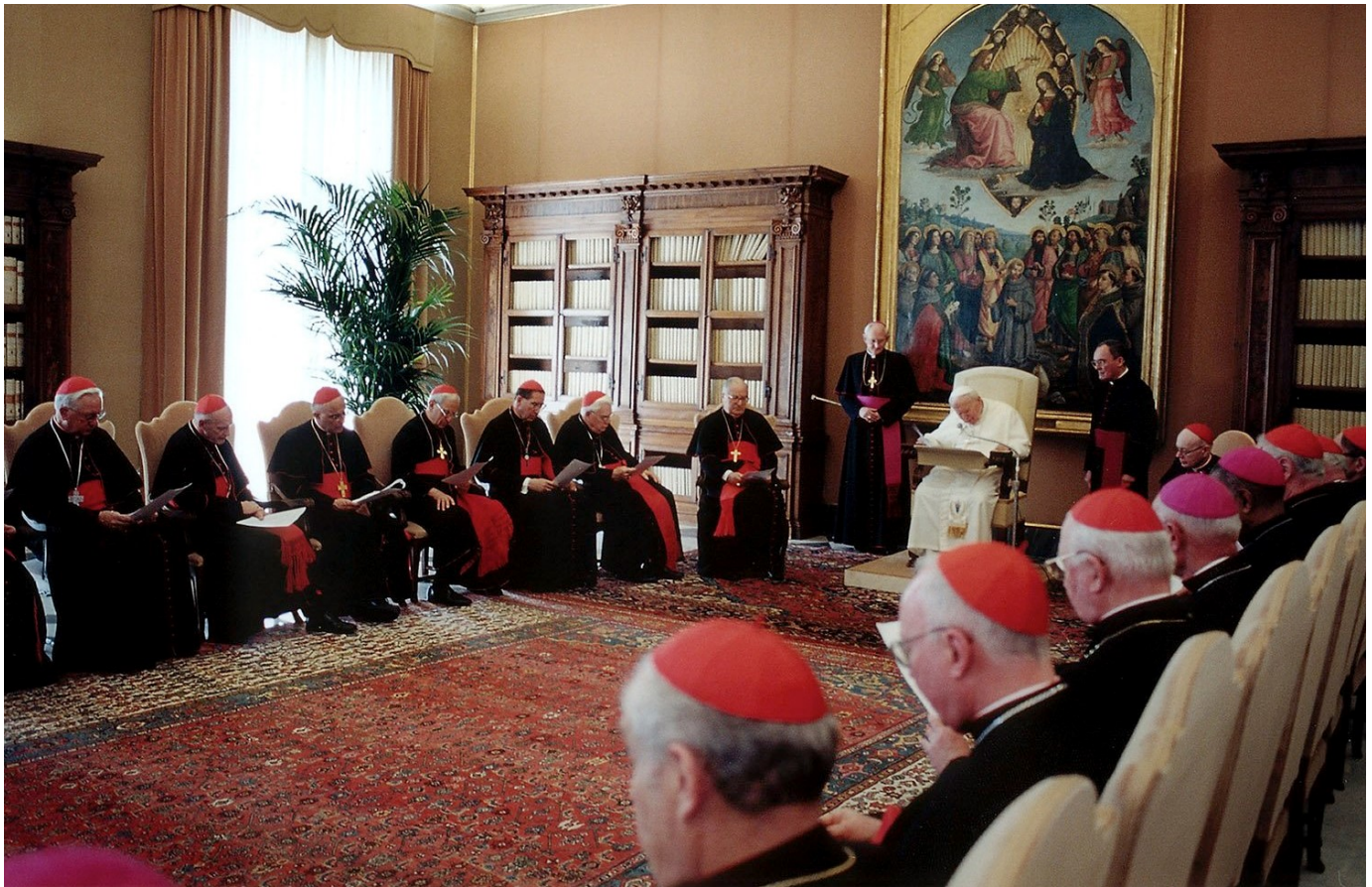
U.S. cardinals listen as Pope John Paul II addresses the special summit on clergy sexual abuse at the Vatican April 23, 2002. Cardinal Angelo Sodano, then Vatican secretary of state, is seated facing left of the pope.

Maccise in 2003 indicted the way documents flooded out of the Vatican that touched directly on the lives of the faithful yet who were never consulted in their drafting: Not one of the 775 convents of the Discalced Carmelites was consulted during the preparation of Verbi Sponsa , the 1999 document on contemplative life and enclosure. Sodano's Curia also exercised "habitual forms of authoritarian violence": using anonymous delations (accusations) to Rome to denounce "heterodox" people, and famously hounding theologians accused of heresy by curial officials who cloaked themselves in sacred power.