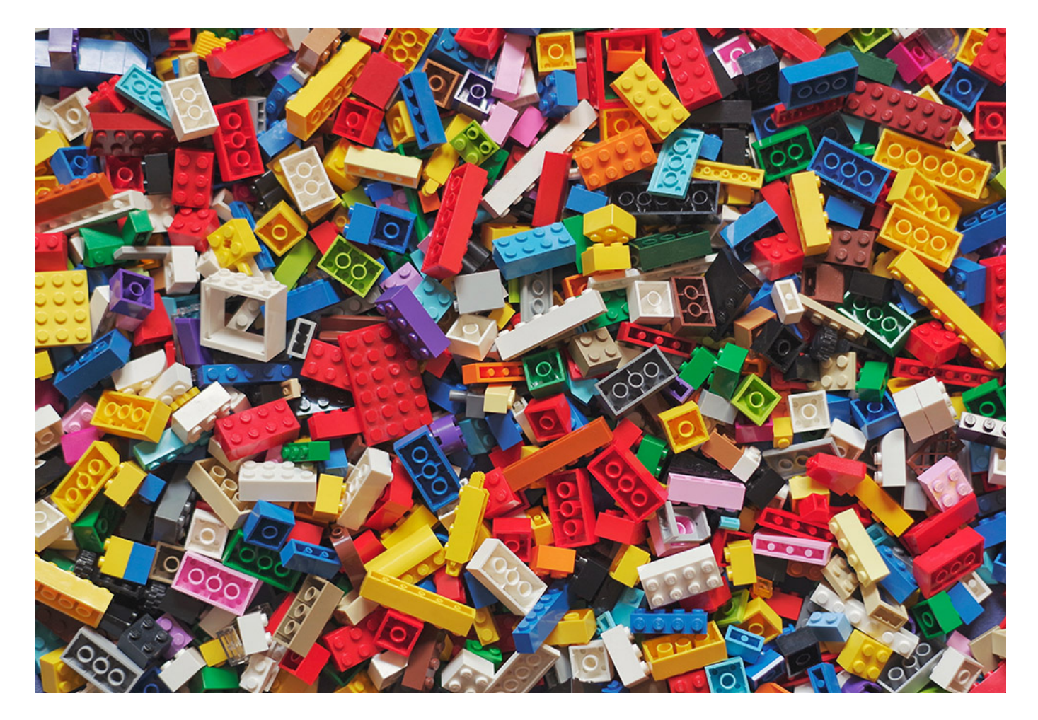
Random Lego pieces

The set depicts Obi-Wan Kenobi's hut on Tatooine, and, more specifically, the moment in which R2-D2 reveals to the old Jedi Knight Princess Leia's secret message. It's a classic, pivotal scene.