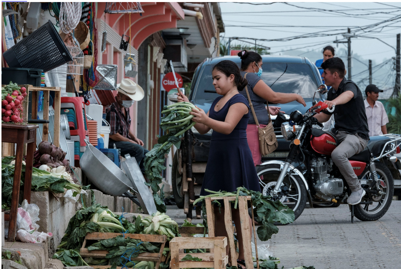
People are seen in El Paraiso, Honduras, July 24, 2021.