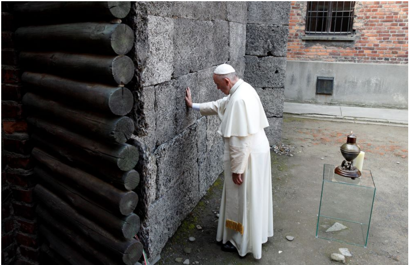
Pope Francis touches the death wall at the Auschwitz Nazi death camp in Oświęcim, Poland, in this July 29, 2016, file photo.

The third pope to visit Auschwitz is Francis, whose pilgrimage and witness builds upon the teachings of these two remarkable papal visits. What did Francis add? He took a great lesson from a mysterious incident in Leviticus, Chapter 10. On the day the Tabernacle was dedicated by Moses and Aaron, two sons of Aaron, Nadav and Avihu, were consumed by the fire in the Tabernacle. Scripture records Aaron's reaction: "and Aaron was silent."