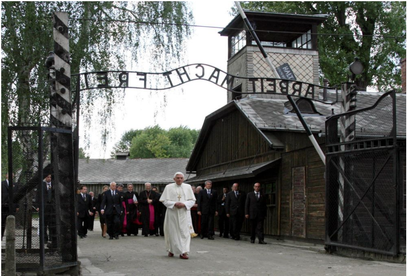
Pope Benedict XVI walks through the gate of Auschwitz in this May 28, 2006, file photo.

The second pope to visit Auschwitz was Benedict XVI. On April 19, 2005, Joseph Cardinal Ratzinger was elected pope. On May 28, 2006, he, too, made a pilgrimage of memorial to Birkenau. Like Pope John Paul II, Pope Benedict XVI paused in front of the Hebrew memorial inscription to the Jews murdered in Birkenau and said :