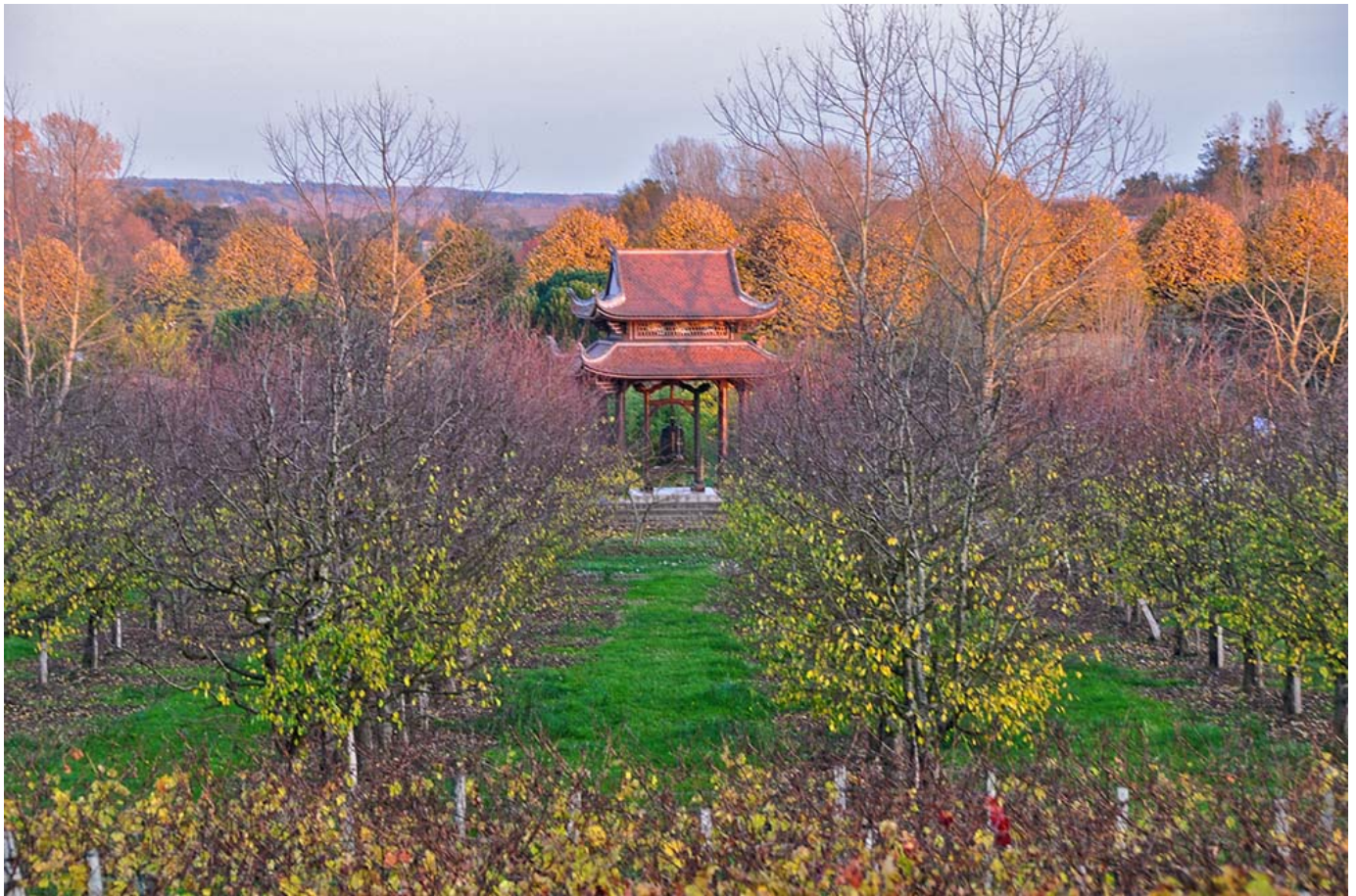
A view of the grounds of Plum Village in France

It was then Nhất Hạnh founded his international retreat center, called Plum Village , near Bordeaux in southwest France, his first Western monastic community. For decades, that would be his new home.