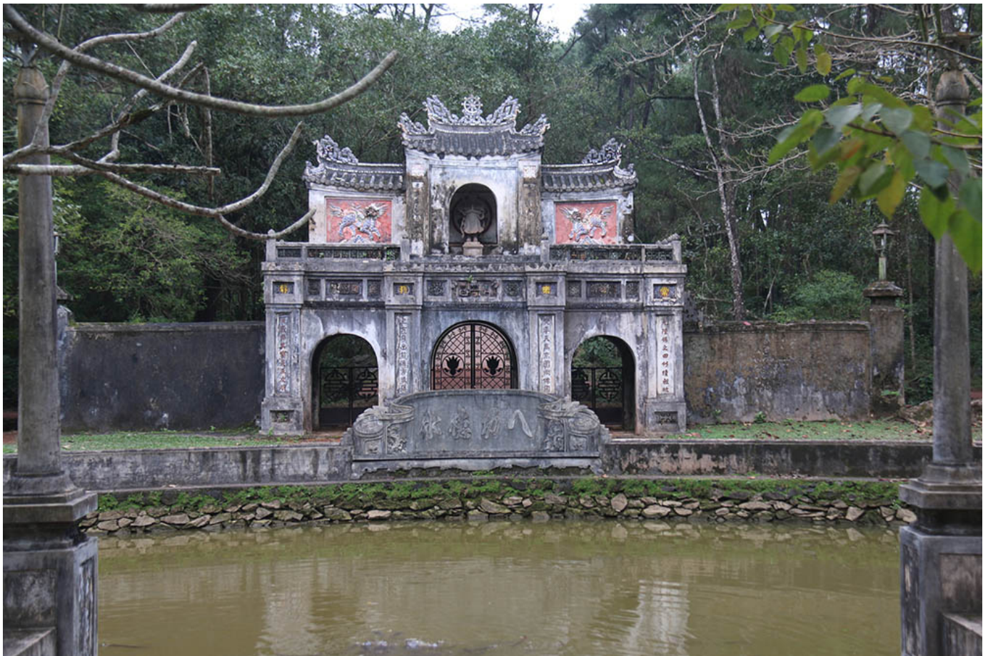
Từ Hiếu Pagoda in Hue, Vietnam

Born in 1926, Nhất Hạnh discovered Buddhism at an early age. He once said he first became interested in Buddhism at the age of 7 or 8 when he saw a picture of Buddha. From then on, he felt called to be a monk and entered the Từ Hiếu temple in Hue in 1942.