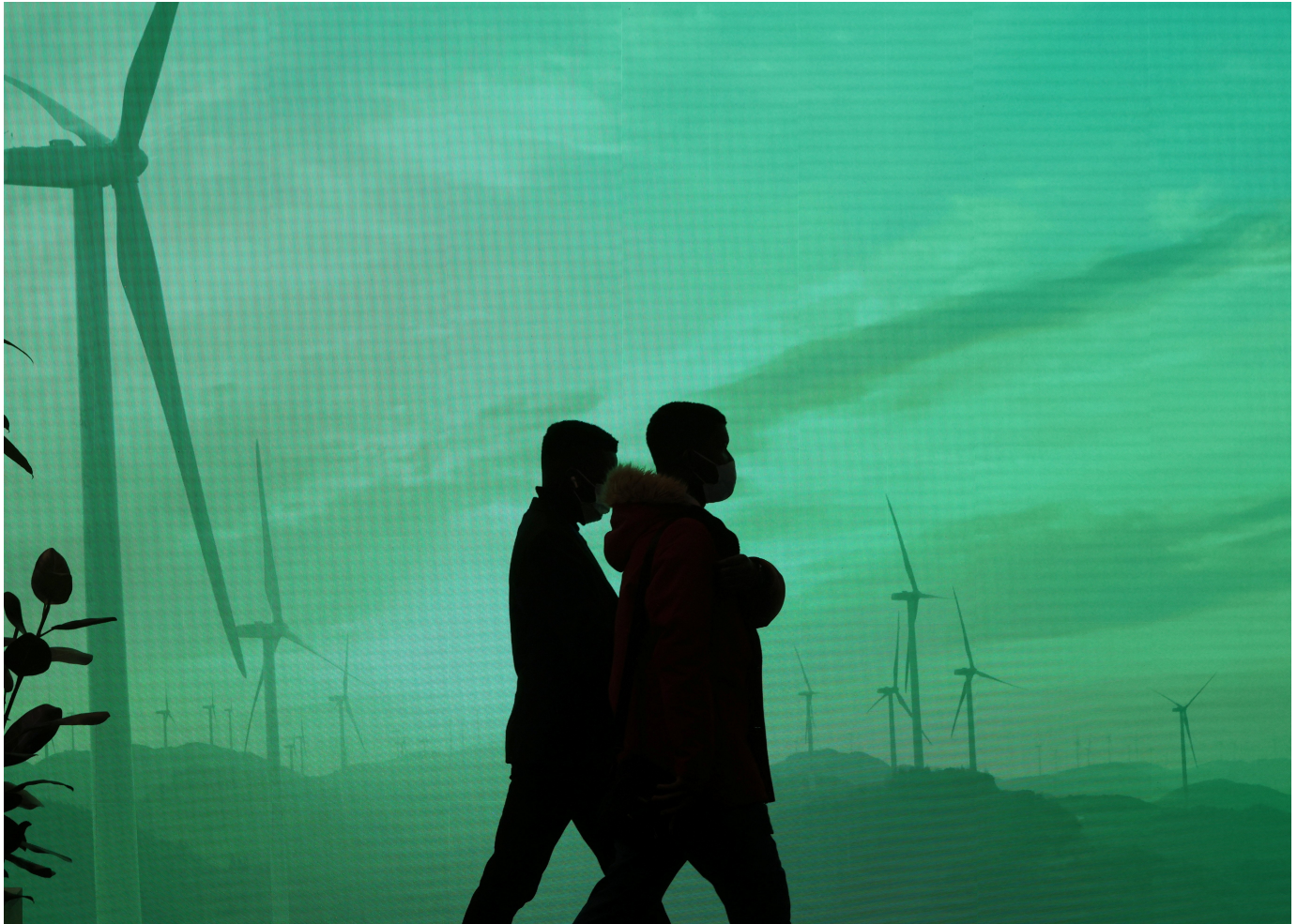
Delegates walk past a screen Nov. 1 during the U.N. Climate Change Conference, COP26, in Glasgow, Scotland.