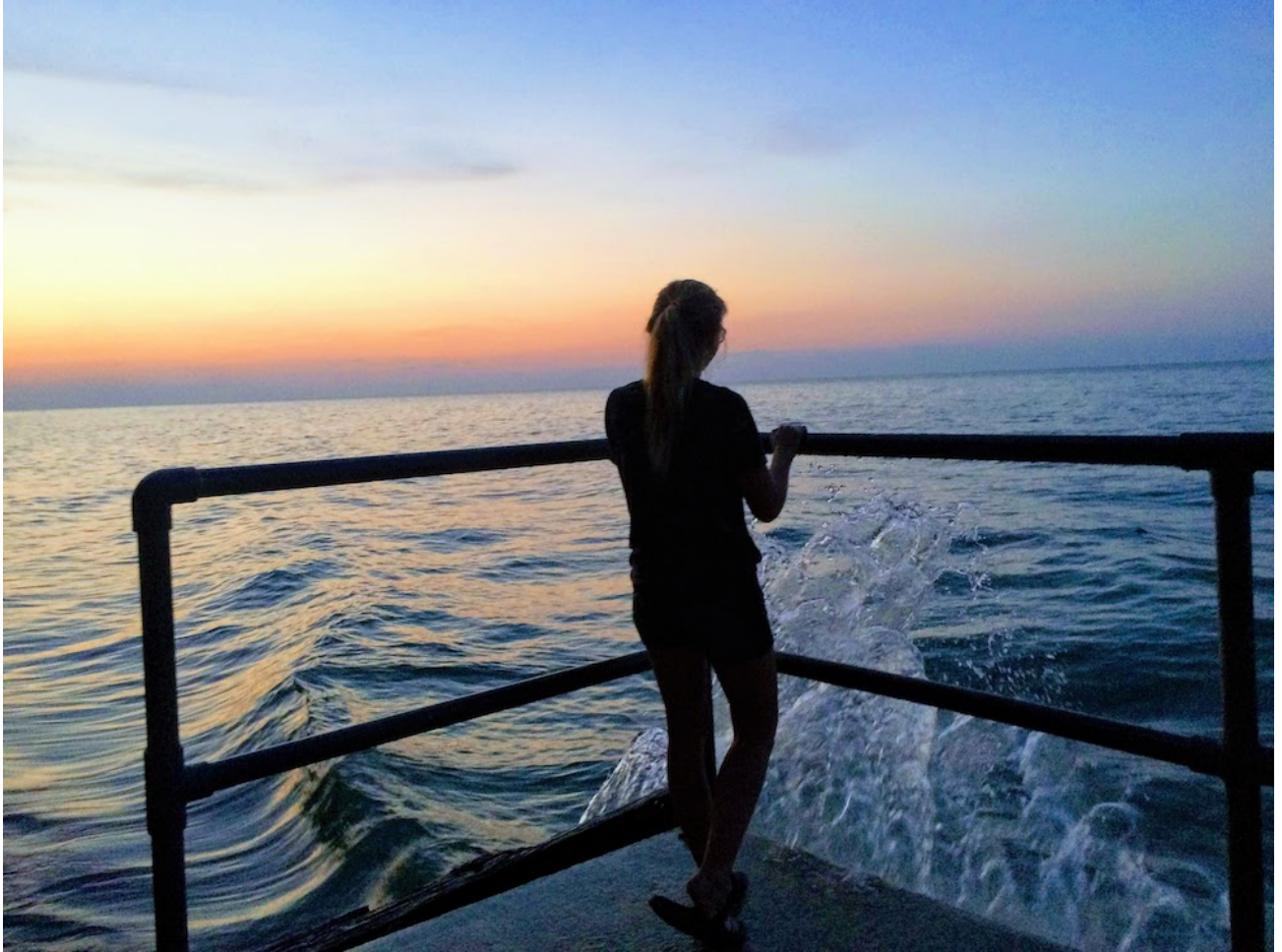
Sunset over Lake Erie, where the author's passion for sustainability was born.

When I was little, Lake Erie and I would play together for hours on end. I would launch myself from her strong, rocky spine into her bright blue embrace and listen to the stories she would whisper through her waves. When I was there, I knew I was home.