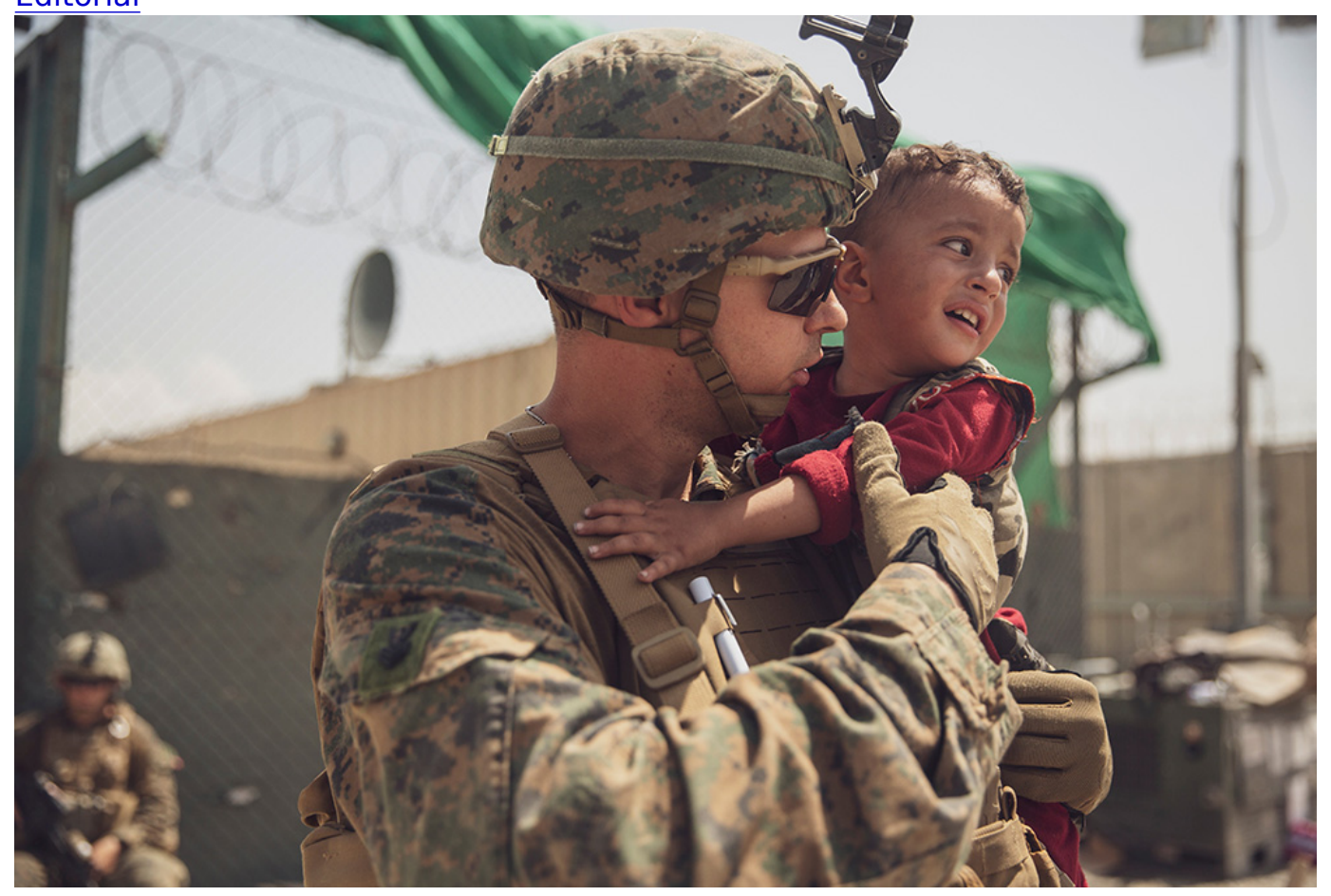
A U.S. Marine calms a toddler during an evacuation at Hamid Karzai International Airport Aug. 22 in Kabul, Afghanistan.