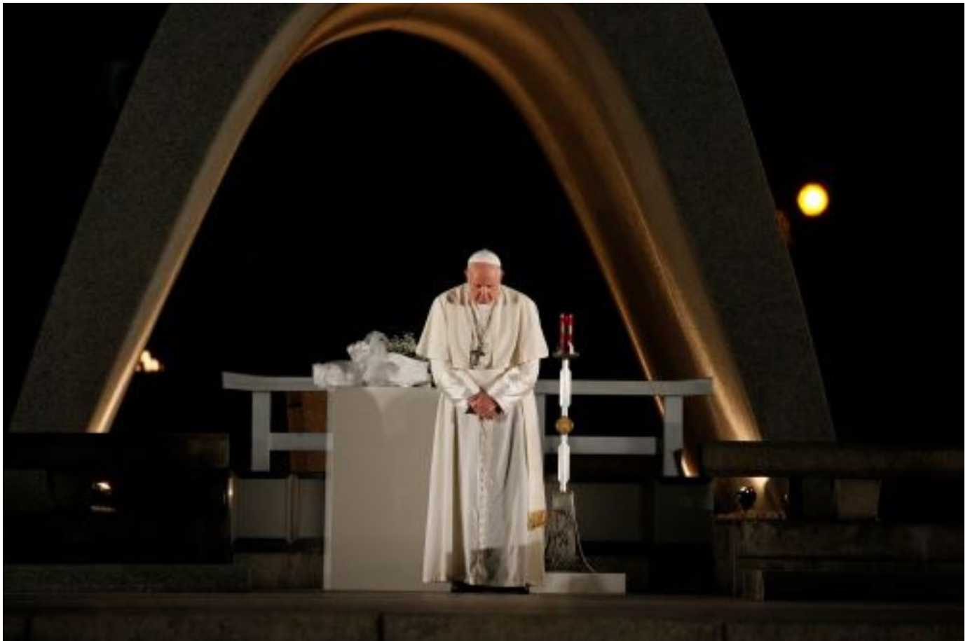
Pope Francis participates in a moment of silence at the Hiroshima Peace Memorial in Japan in 2019. "The use of atomic energy for purposes of war is immoral, just as the possessing of nuclear weapons is immoral," the pope said during that visit.

Today, I want you to feel in this hall the presence of all those who perished in Hiroshima and Nagasaki. I want you to feel, above and around us, a great cloud of a quarter-million. ...souls. Each person had a name. Each person was loved by someone. Let us ensure that their deaths were not in vain. ... The development of nuclear weapons signifies not a country's elevation to greatness, but its descent to the darkest depths of depravity. These weapons are not a necessary evil; they are the ultimate evil.