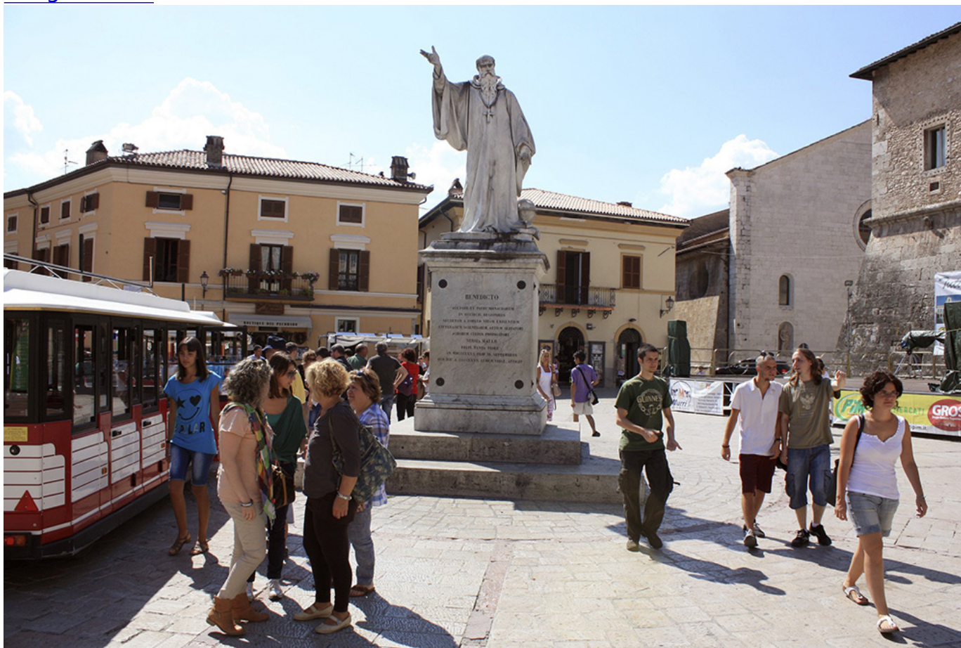
Tourists and townspeople surround a statue of St. Benedict Aug. 14, 2013, in the small Italian town of Norcia.