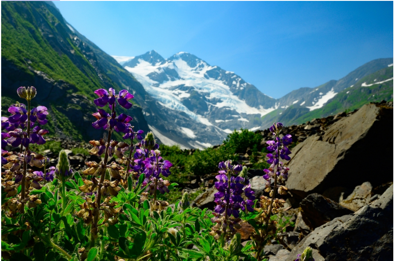
Colorful wildflowers frame the peak of Byron Glacier near Girwood, Alaska, July 3, 2019.