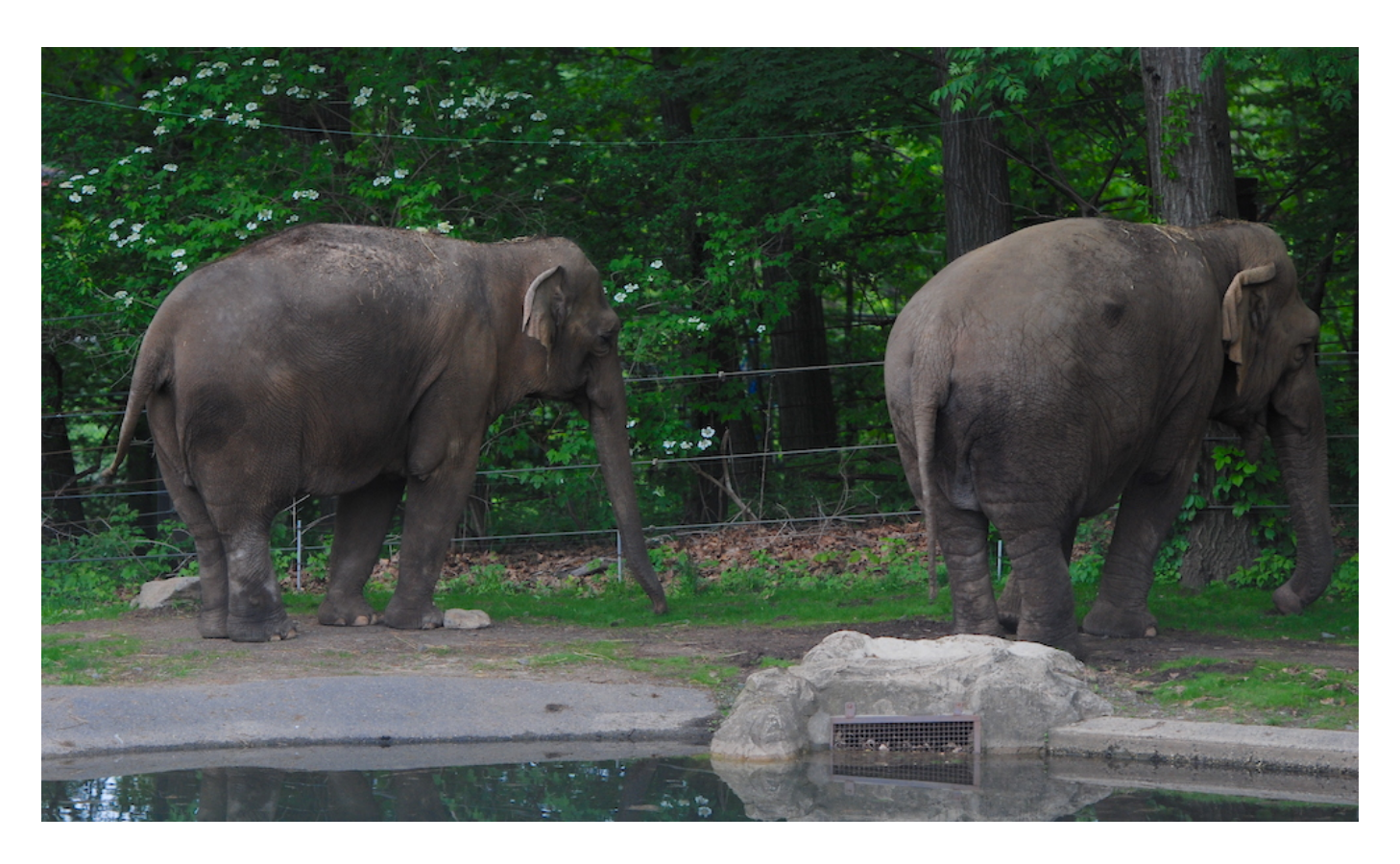
Asian elephants at The Bronx Zoo, New York City, May 23, 2014

And then we applied that general argument to Happy, a 49-year-old pachyderm, who is not a thing for us to confine, use and put on display in a zoo (even in an attempt to produce a good outcome), but rather a particular kind of creature whom God made to flourish.