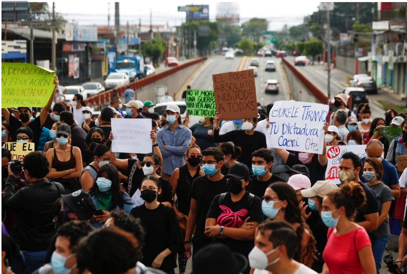
People protest in San Salvador, El Salvador, May 2, 2021, after the Salvadoran congress removed constitutional court judges and the attorney general.