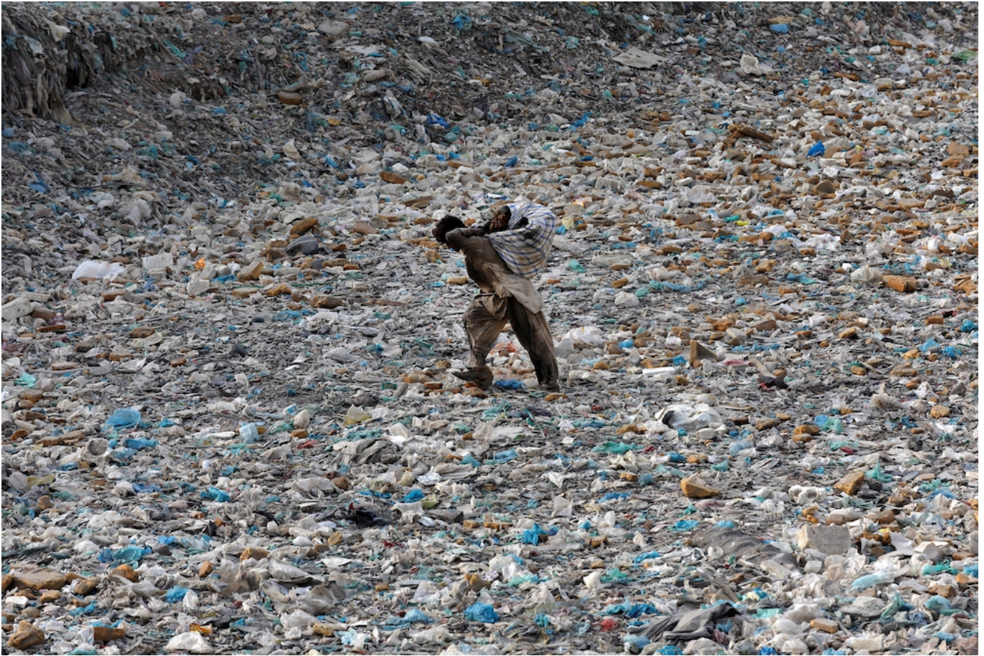
A boy carrying a sack of recyclables walks through trash in Karachi, Pakistan, June 4, 2020.