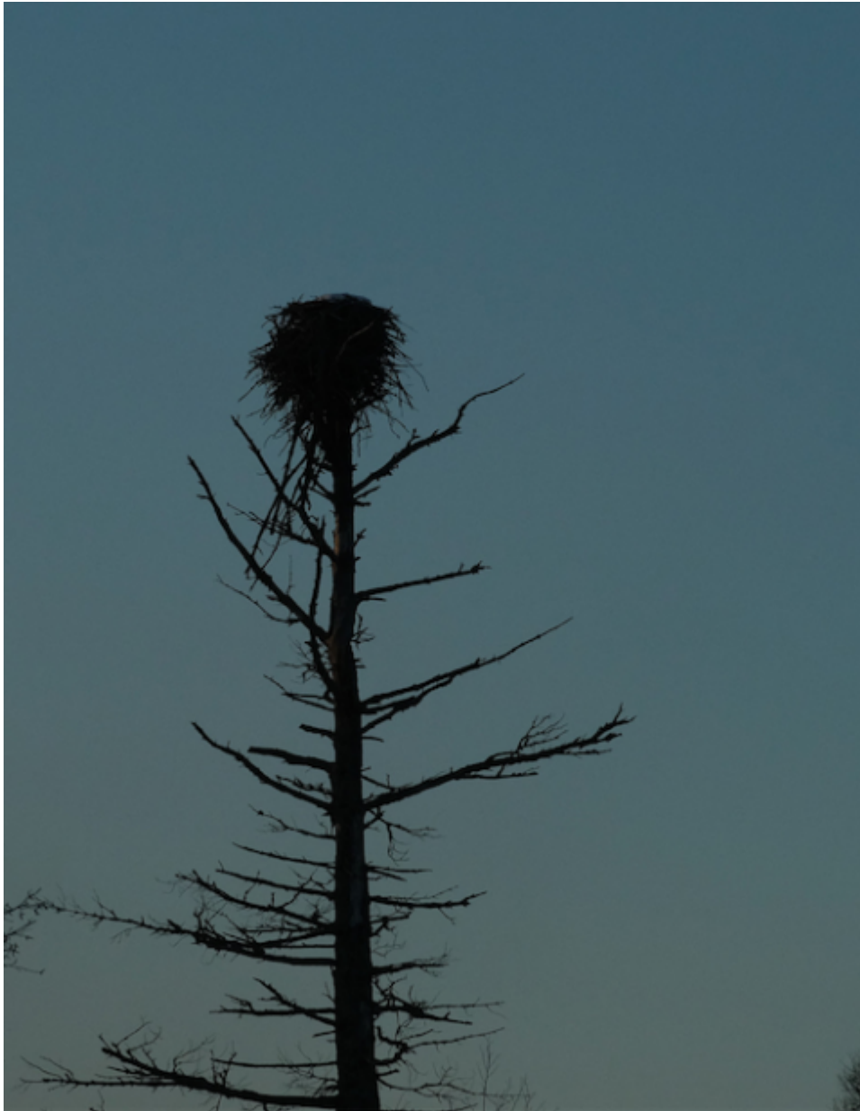
An eagle nest near the Enbridge Line 3 construction site in northern Minnesota

More than a foodstuff, the wild rice, or manoomin , symbolizes the essential cultural connection between land, subsistence gathering and the Ojibwe world view. The act of "making rice" is a tangible expression of the Ojibwe relationship with the earth, one of sustainability and commitment to ensuring resources are protected and available for future generations.