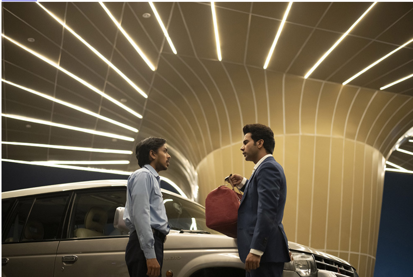
Adarsh Gourav as Balram and Rajkummar Rao as Ashok in "The White Tiger"