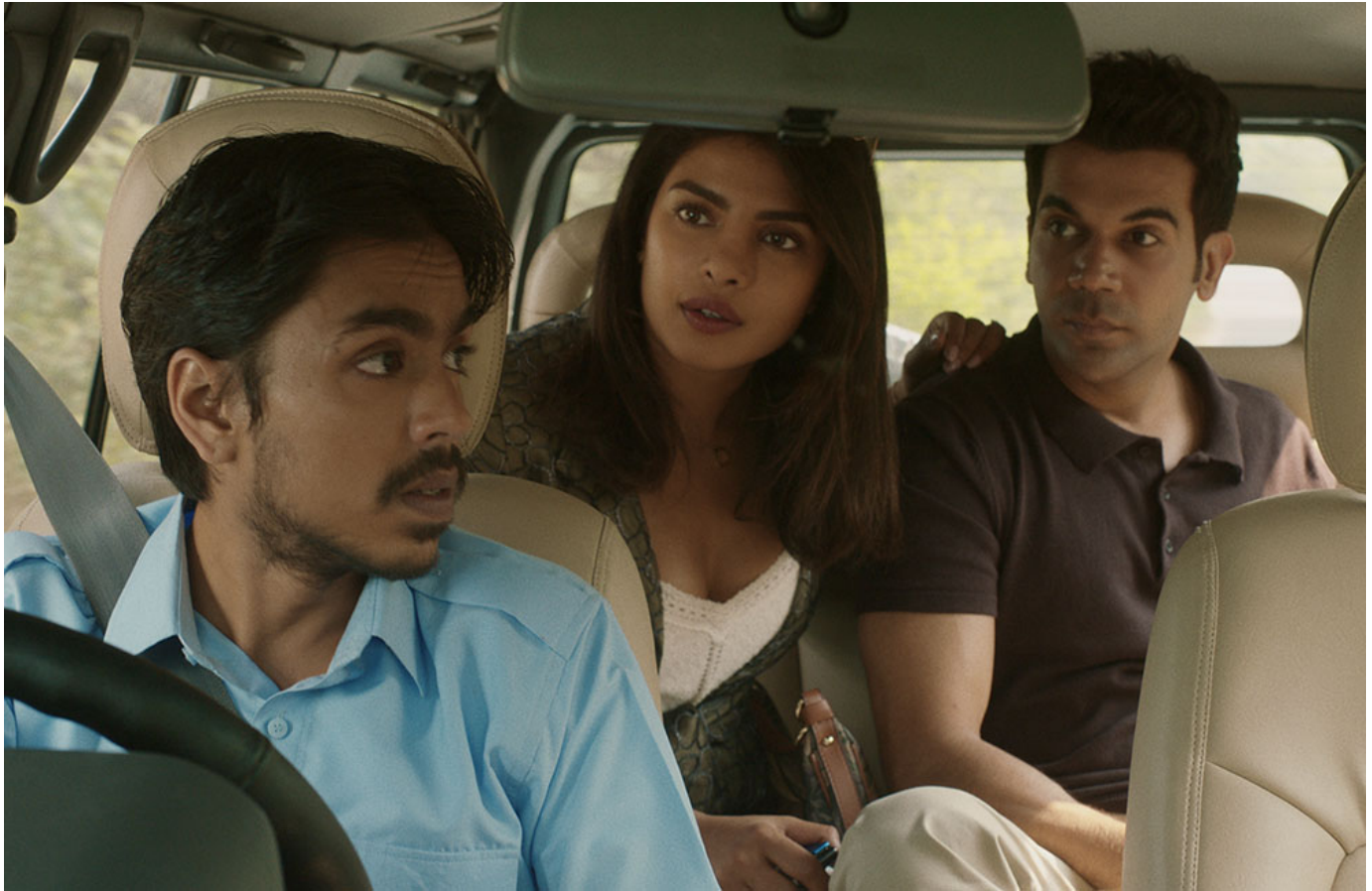
From left: Adarsh Gourav (Balram), Priyanka Chopra Jonas (Pinky) and Rajkummar Rao (Ashok) in "The White Tiger" (Netflix ©2020)

On learning the ruthlessness of his employer, the white tiger unleashes his fury. However, he makes sure to keep his rage a secret from his oppressor. He begins to get back at Ashok by learning tricks from other drivers who con their masters. Yet earning rupees on the side is not enough to lift our white tiger out of poverty, nor does it justify his suffering.