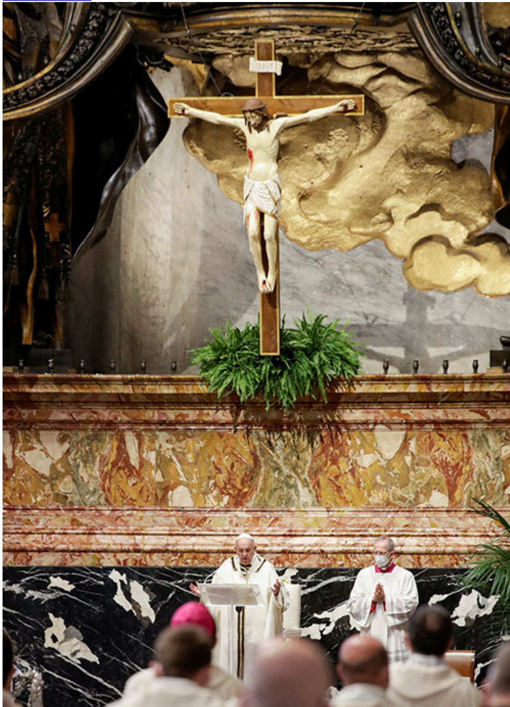
Pope Francis gives the homily as he celebrates Holy Thursday chrism Mass in St. Peter's Basilica at the Vatican April 1, 2021.