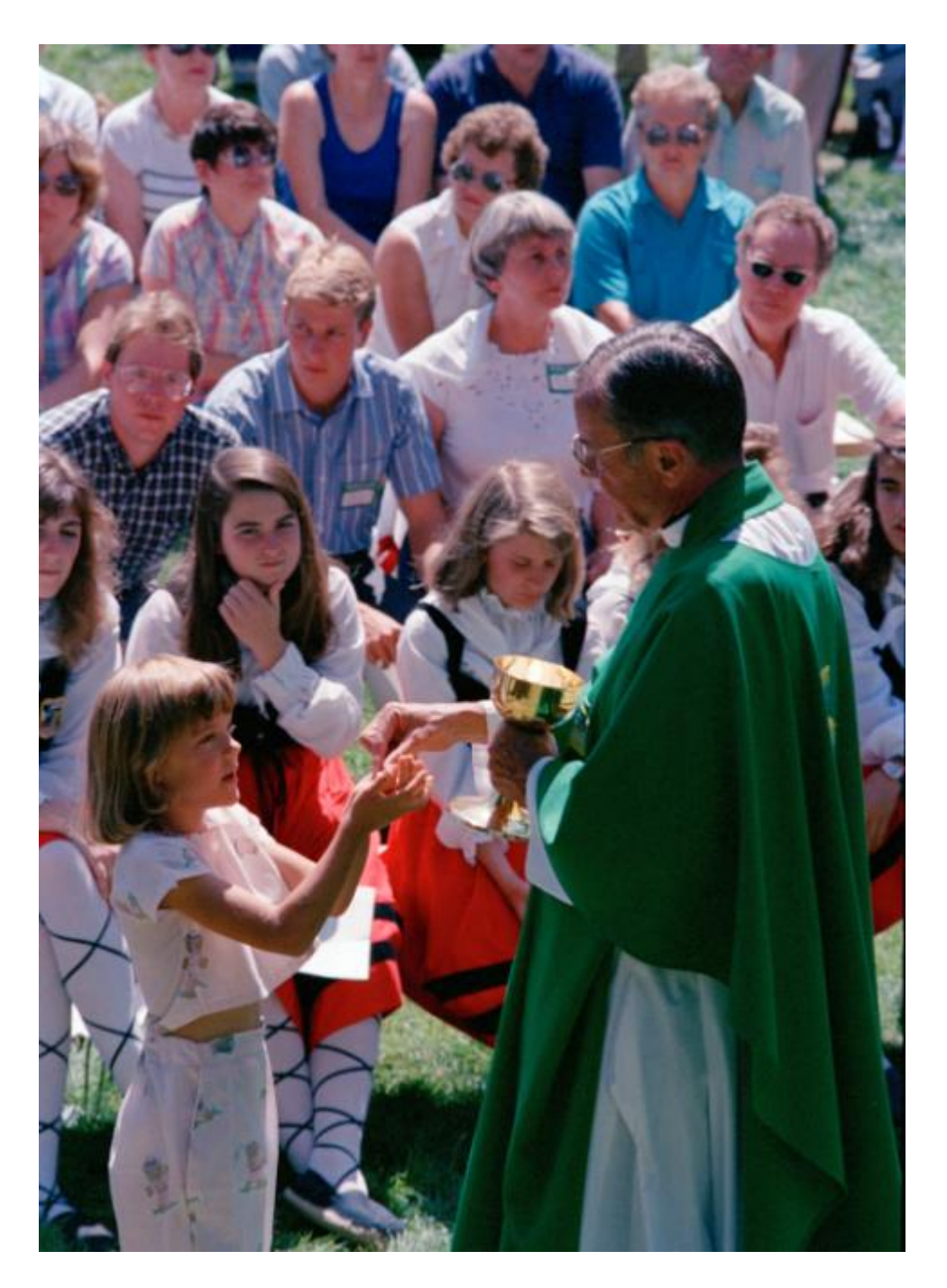
In this Sept. 19, 1988 file photo Rev. Joseph Hart dispenses communion during an outdoor Mass celebrated for participants of the Basque Festival in Buffalo, Wyo.

The Vatican has cleared a retired U.S. bishop of multiple allegations he sexually abused minors and teenagers, rejecting lay experts' determination that a half-dozen claims were credible and instead slapping him on the wrist for what it called "flagrant" imprudent behavior.