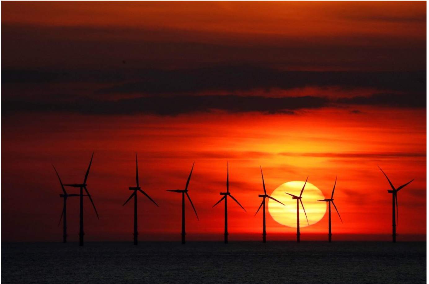
A wind turbine farm near New Brighton, England