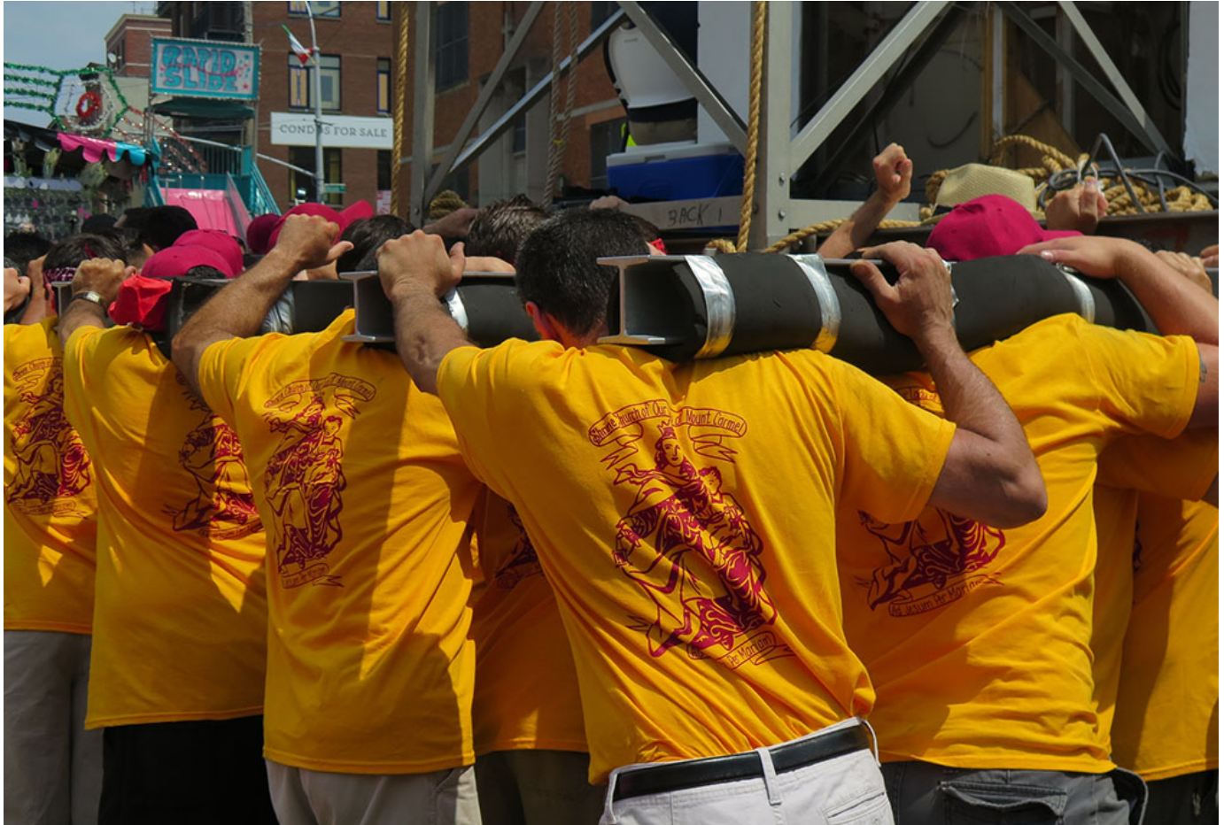
Men carry the 1-ton steel tower during the 2015 giglio parade in Williamsburg, Brooklyn, New York.